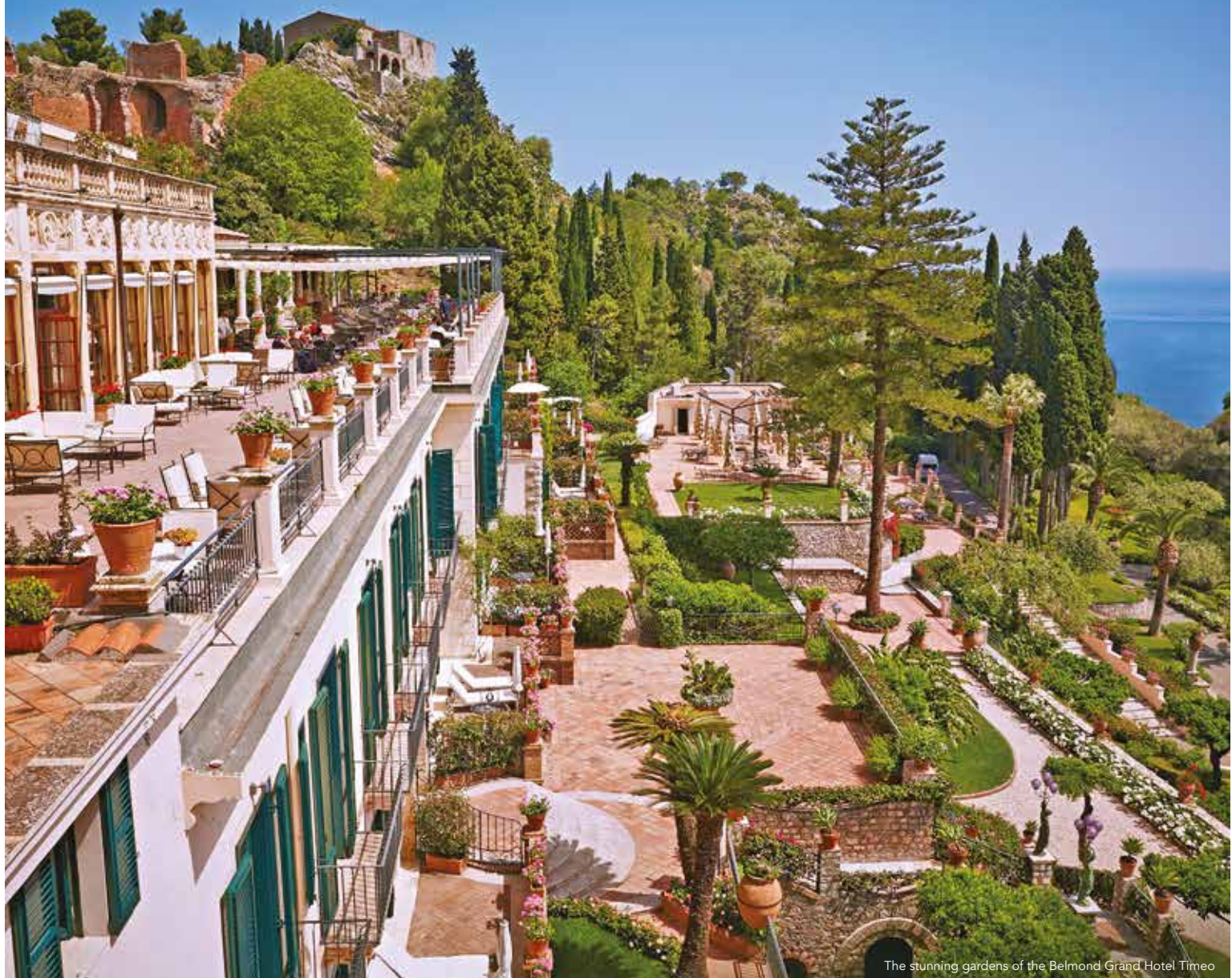
The stunning gardens of the Belmond Grand Hotel Timeo

This is a wonderful region for a relaxing week and, when you can pull yourself away from the beautiful gardens and magnificent pool at the hotel there is much to explore. We have therefore devised an itinerary which includes ample time to enjoy the hotel's many delights but with the added benefit of guided excursions including Mount Etna and Zafferana Etnea, for a tasting of local delicacies and a winery tour, the ancient city of Tindari and a visit to the incredible Roman mosaics of Villa Romana del Casale.