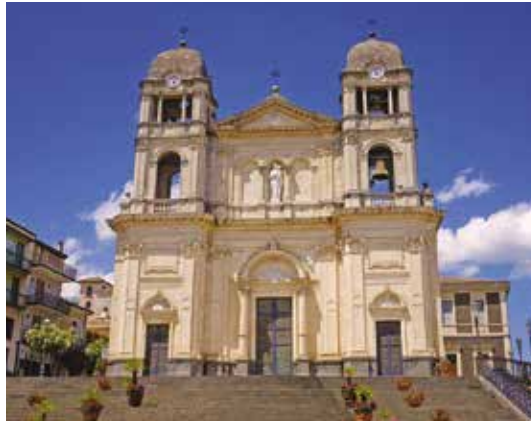
Church of Saint Maria della Provvidenza in Zafferana Etnea