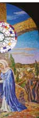
Sanctuary at Tindari

Day 8 Taormina to London. Transfer to Catania airport for the return scheduled flight to London. (B)