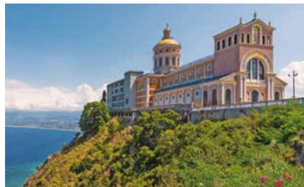
Sanctuary of the Madonna Nera, Tindari