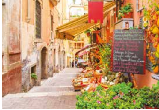
Colourful streets of Taormina