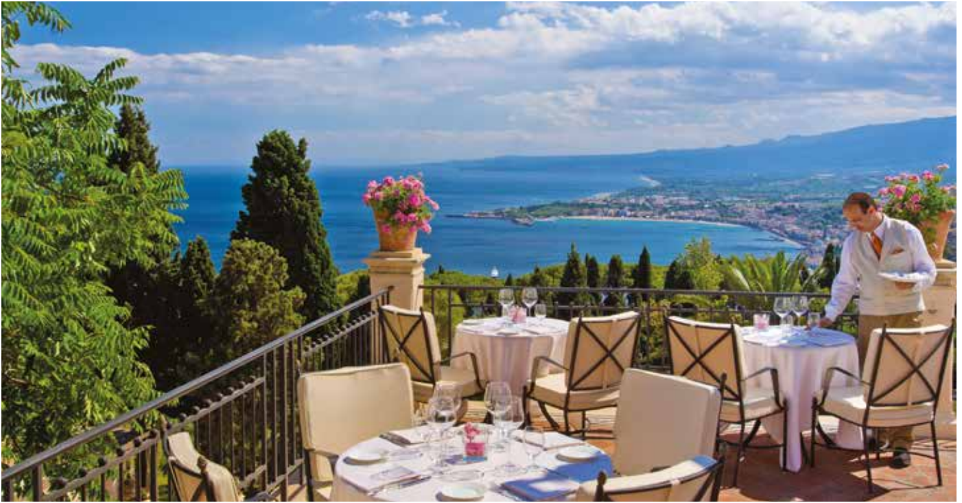
The Terrace Restaurant overlooking Mount Etna