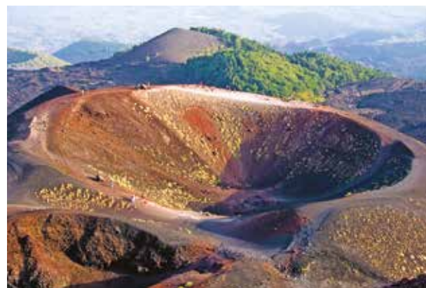
Crateri Silvestri at Mount Etna

Day 4 Milazzo & Tindari. After breakfast we head to the province of Messina on the northern coast to Milazzo. Several civilizations settled in Milazzo and left signs of their presence from the Neolithic age. In Homer's Odyssey Milazzo is the place where Ulysses is shipwrecked and meets Polyphemus. A highlight is the Castle of Milazzo which dates from the 1500s and is a unique example of a Sicilian fortified Gothic city. The whole of Milazzo once fitted within its massive walls. Nowadays it is a lovely site full of flowers and crumbling fortifications, with beautiful views of the bay and the Aeolian Islands. We will stroll around the old town and have lunch in a typical Sicilian restaurant before heading to Tindari. Tindari was founded by Syracusan merchants during the war against Carthage in 396 BC, the ruins of the ancient city are relatively well-preserved and the structure that astounds above all others is the Greek Theatre. Dating back as far as the end of the 4th century, the theatre is a marvel of acoustic engineering, and has hosted music, dance and theatre festivals over the last 70 years. Standing next to a promontory, it looks out nobly toward the sea. The Sanctuary of the Madonna Nera, however, is the foremost attraction in Tindari. Inside, the