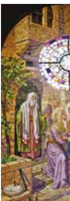
Mosaic from the Sanctuary of the Madonna Nera