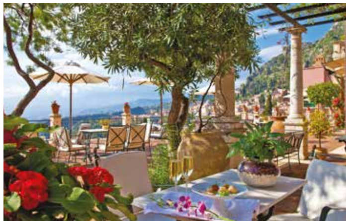
The Literary Terrace and Bar