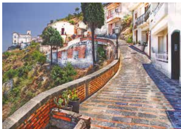
The picturesque hill-top village of Savoca