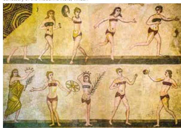
Mosaic floor, Villa Romana del Casale, Piazza Armerina

sculpture of the Virgin and Child, in citron wood, is said to have reached Tindari in an attempt by the faithful to keep it safe from the 8th century Byzantine Iconoclast movement. According to legend, the statue was abandoned by the sailors of a ship moored under the promontory; otherwise they feared that to take it with them would go against divine will and prevent them from setting sail anew. Today, the Black Madonna is venerated every September 7th. Beneath the promontory lies the Tindari Lagoon, a small strait of water of exceptional beauty that today is a nature reserve characterised by alternating beaches, dunes, lagoons and reefs. (B, L)