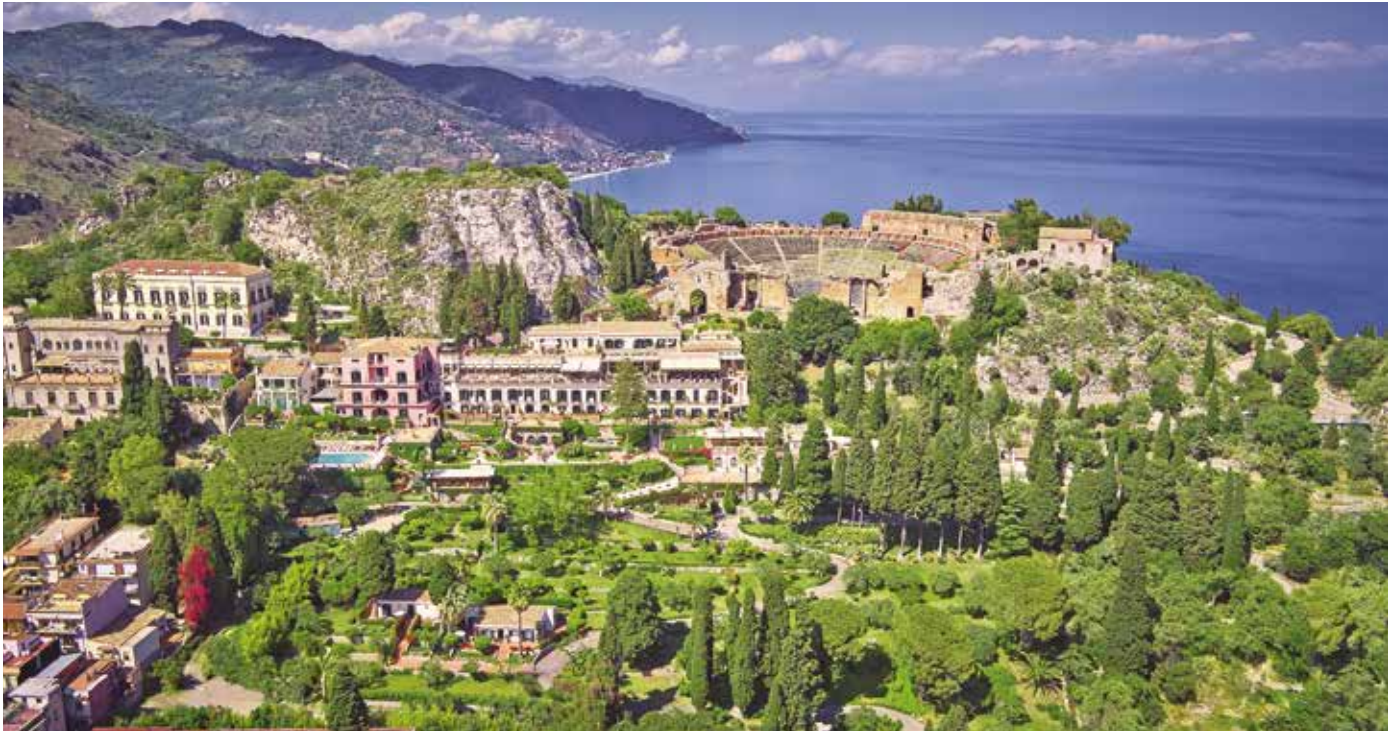
The Greek Theatre overlooking the Belmond Grand Hotel Timeo