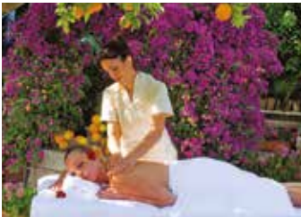
Massage at the Wellness Centre