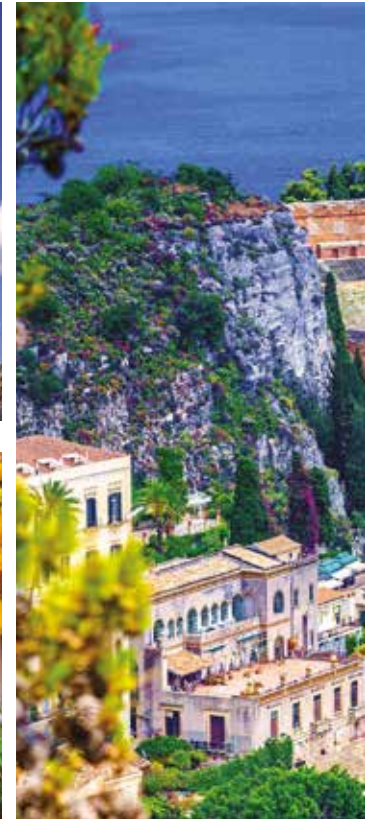
The Greek Theatre and the Belmond Grand Hotel