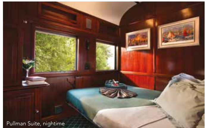
Pullman Suite, nighttime