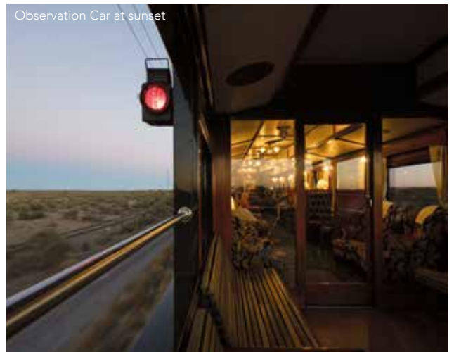
Observation Car at sunset

In maintaining the spirit of travel of a bygone era, there are no radios or television sets on board. The use of mobile phones, laptops and essentially anything that has the ability to disturb other passengers is confined to the privacy of your suites only. For days on the train the dress code is casual. During the day, comfortable and casual attire is appropriate, and the evenings are smart casual.