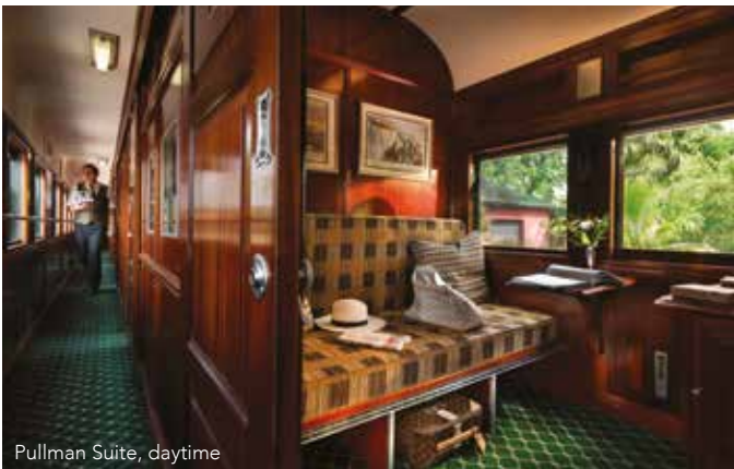
Pullman Suite, daytime

With discreet and friendly service, top cuisine and a selection of South Africa's finest wines, Rovos Rail harks back to a simpler, more elegant era encompassing the timeless grace and high romance of African exploration. The beautifully rebuilt train, which may be hauled by diesel or electric locomotives, carries a maximum of 72 passengers in 36 superbly appointed suites.