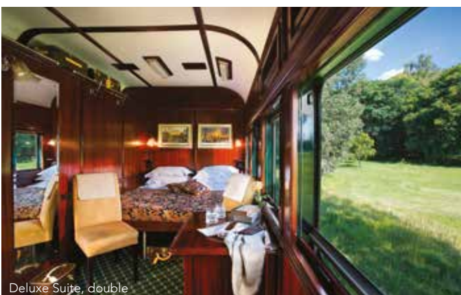
Deluxe Suite, double