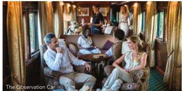
The Observation Car