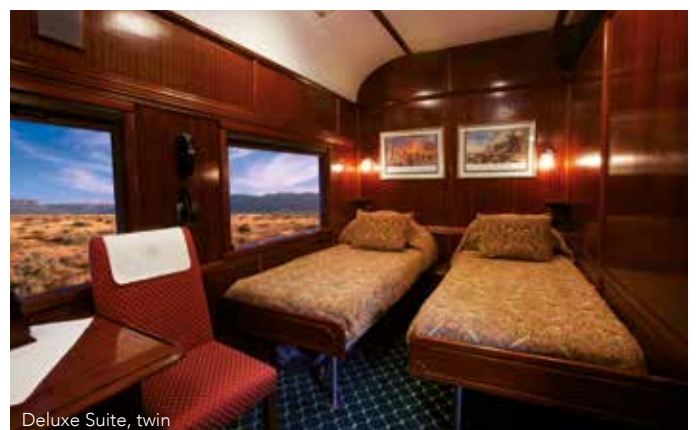
Deluxe Suite, twin