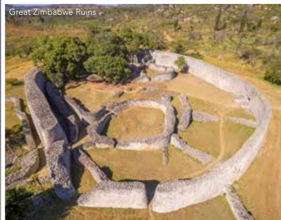
Great Zimbabwe Ruins

displays a wide variety of skillfully crafted candles, woodcarvings, colourful textiles and superb basketwork for which Swazis are renowned. At Mantenga Cultural Village we discover a living museum of traditions representing life in the 1800s. (B, L, D)