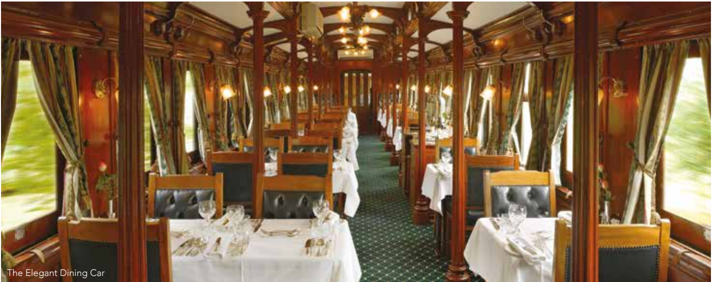
The Elegant Dining Car