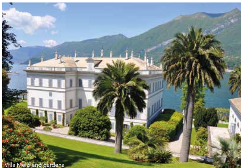
Villa Melzi and gardens