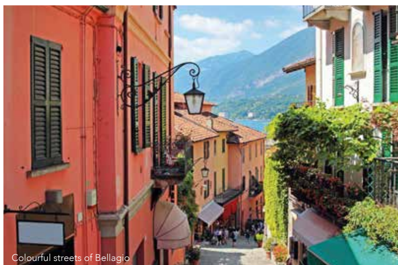
Colourful streets of Bellagio