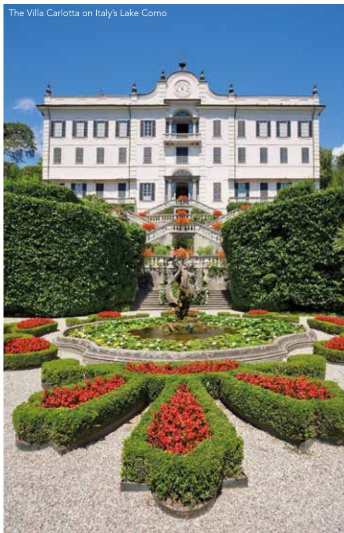
The Villa Carlotta on Italy's Lake Como