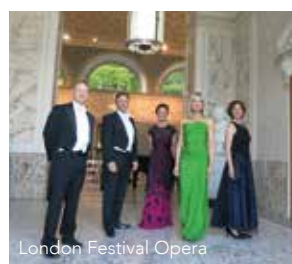
London Festival Opera

Gardens of Babylon. The palace is decorated with fine furniture and some interesting paintings, but it is the ten terraces of the gardens with their English Garden, Italian Garden, Azalea Garden and Mosaic Garden which capture the imagination. In the afternoon we will sail across to the larger of the two islands, Isola Madre. Here, five gardens connect in a peaceful woodland setting.