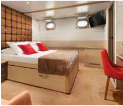
Cat 1 Cabin