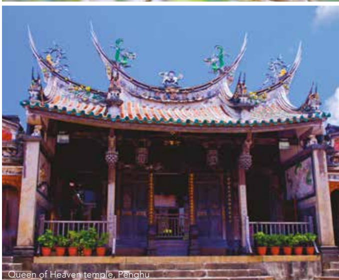
Queen of Heaven temple, Penghu