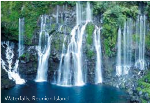
Waterfalls, Reunion Island