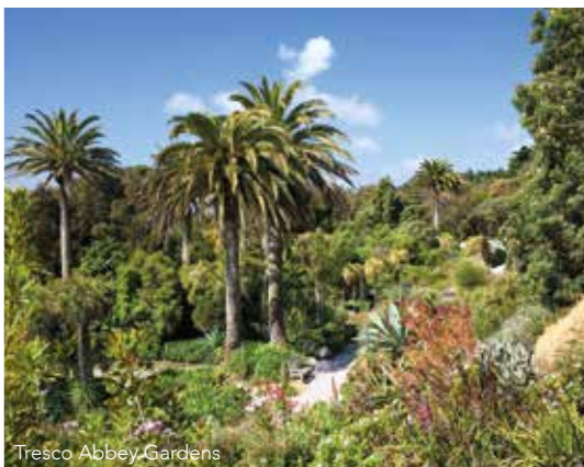
Tresco Abbey Gardens