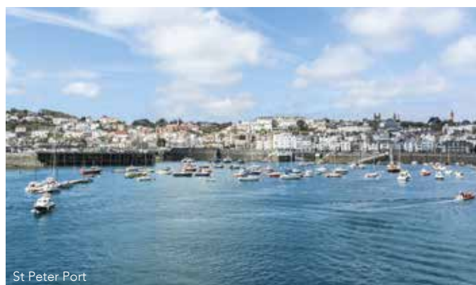
St Peter Port

Day 8 Portsmouth, England. Disembark this morning. Transfers will be provided to Portsmouth Harbour Railway Station at a fixed time.