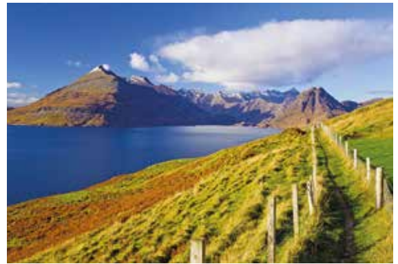
Loch Scaivaig and the Cullin Mountains