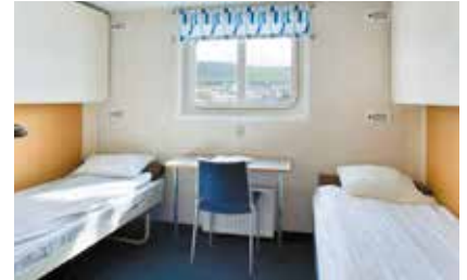
Category 3 cabin