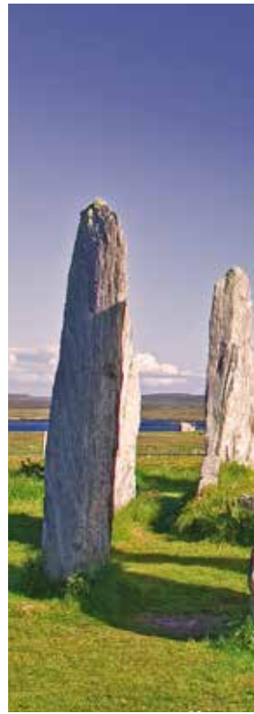
Standing Stones of Callanish, Isle of Lewis

Words do not do justice to the spectacular beauty, rich wildlife and fascinating history of the Inner and Outer Hebrides which we will explore during this expedition aboard the Ocean Nova. One of Europe's last true remaining wilderness areas affords the traveller a marvellous island hopping journey through stunning scenery accompanied by spectacular sunsets and prolific birdlife. With our naturalists and local guides and our fleet of nimble Zodiacs we are able to visit some of the most remote and uninhabited islands that surround the Scottish coast including St Kilda and Mingulay as well as the small island communities of Canna and Iona.