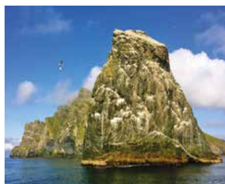
Gannetry of Stac Lee

Day 4 Stornoway & Shiant Isles. Arrive today on the Isle of Lewis. On leaving the island capital of Stornoway, we will head across the island to the beautiful west coast. Described as Scotland's Stonehenge, the Callanish Standing Stones date from around 3000 BC, there are a total of 32 stones in a circular and avenue design which stand like a petrified forest on the flat top of a peninsula which reaches out into East Loch Roag. We also visit the Dun Carloway Pictish Broch, probably built sometime in the last century BC, it would have served as an occasionally defensible residence for an extended family complete with accommodation for animals at ground floor level. Our final stop is the Gèarrannan Blackhouse Village – a reconstructed settlement of traditional black houses which were made using dry stone masonry and have thatched roofs, distinctively weighted down with rocks. Visit the small museum, enjoy a display of a typical crofting activity such as weaving and take in the views at this dramatic site on the wild Atlantic coast. Spend the afternoon exploring the Shiant Isles. Anyone