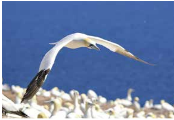
Gannet in flight