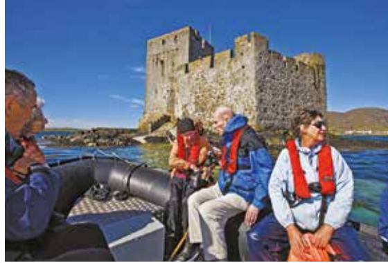
Exploring the island of Barra