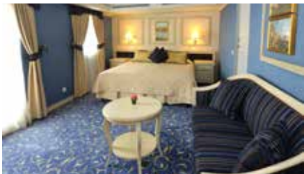
SERENISSIMA SUITE (approx. 25 square metres)