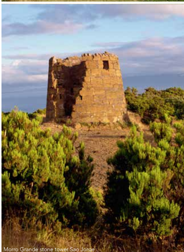
Morro Grande stone tower Sao Jorge