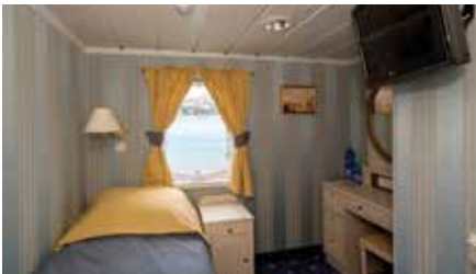
STANDARD SINGLE (approx. 7 to 12.5 square metres)