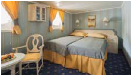
SUPERIOR STATEROOM (approx. 11.5 to 18 square metres)