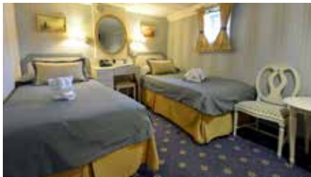
CLASSIC STATEROOM (approx. 14 to 19 square metres)