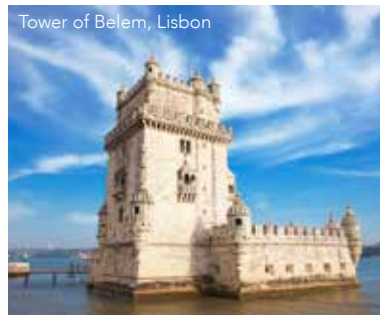
Tower of Belem, Lisbon