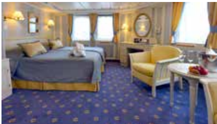
OWNER'S SUITE (approx. 22 square metres)