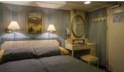
STANDARD STATEROOM (approx. 10 to 11.5 square metres)