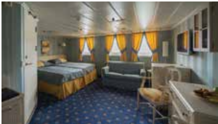
JUNIOR SUITE (approx. 21 square metres)