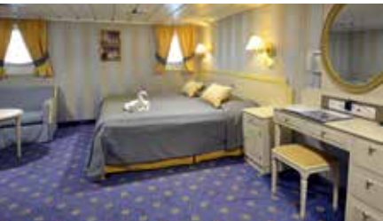
DELUXE STATEROOM (approx. 15 to 25 square metres)