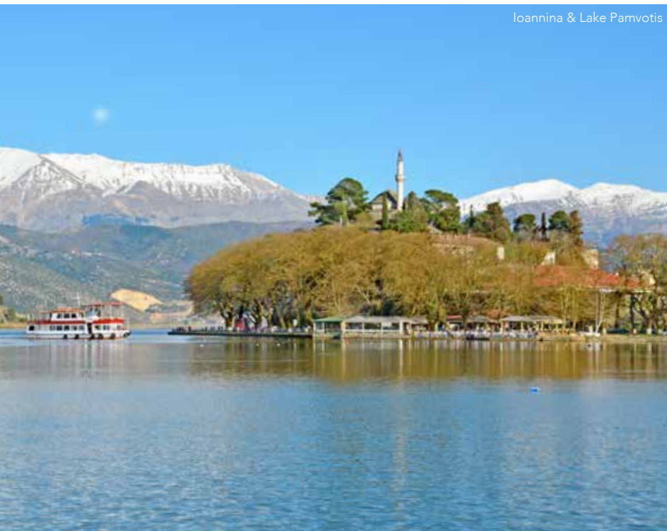
Ioannina & Lake Pamvotis