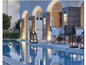
Du Sel Restaurant