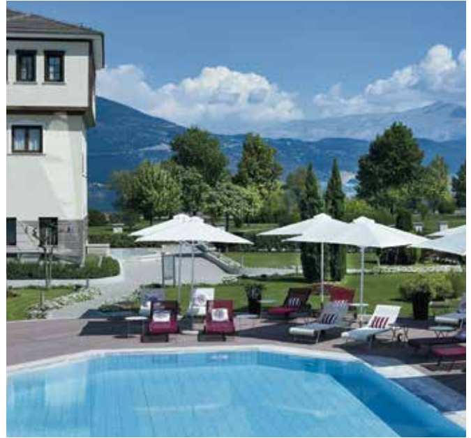
Exterior and pool area

The Hotel Du Lac is a lakeside hotel offering traditional elegance and modern luxury. Located just a 15 minute walk from the centre of Ioannina, the hotel is close enough to explore the vibrant town whilst offering peaceful surroundings to relax in. Rooms measure a spacious 38 square metres and are simply and elegantly decorated. They feature the standard amenities including television, hairdryer, minibar, safe and complimentary Wi-Fi. The hotel offers four dining options including an all day café boasting breathtaking views of Pamvotis Lake and a bar. There is an indoor and outdoor pool as well as a spa complete with sauna and steam room.