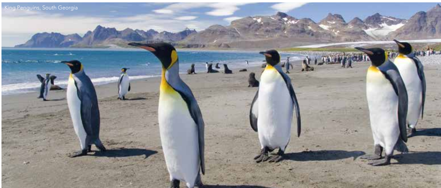
King Penguins, South Georgia

Even today after many decades of exploration, Antarctica remains a world apart, a majestic last frontier surpassing even the most jaded of travellers' expectations. For this magnificent voyage we are working with our long time Swedish associates at PolarQuest who have chartered the 84-passenger Ocean Nova, and we will follow in the footsteps of researchers, pioneers, adventurers and discoverers on an expedition to the sixth continent. It is hard to put into words the sheer grandeur of an Antarctic landscape. This most southern of continents, this desert of ice, is so unique and uncommon to man's experience, that even the most dramatic of photographs pale into insignificance when one is confronted by the sheer magnitude, beauty and wonder of an Antarctic landscape.