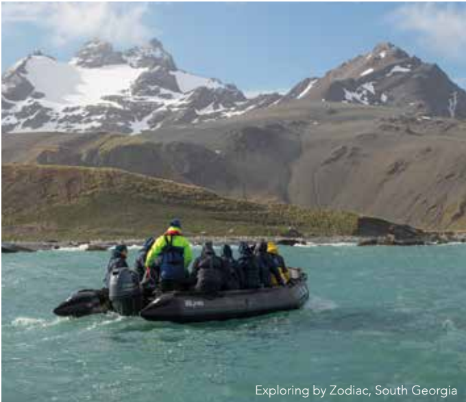
Exploring by Zodiac, South Georgia