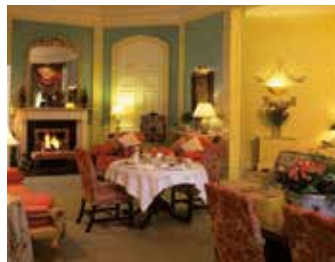
Master Suite – The Print Room