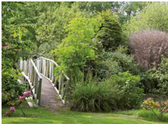
Marlfield House Hotel Gardens