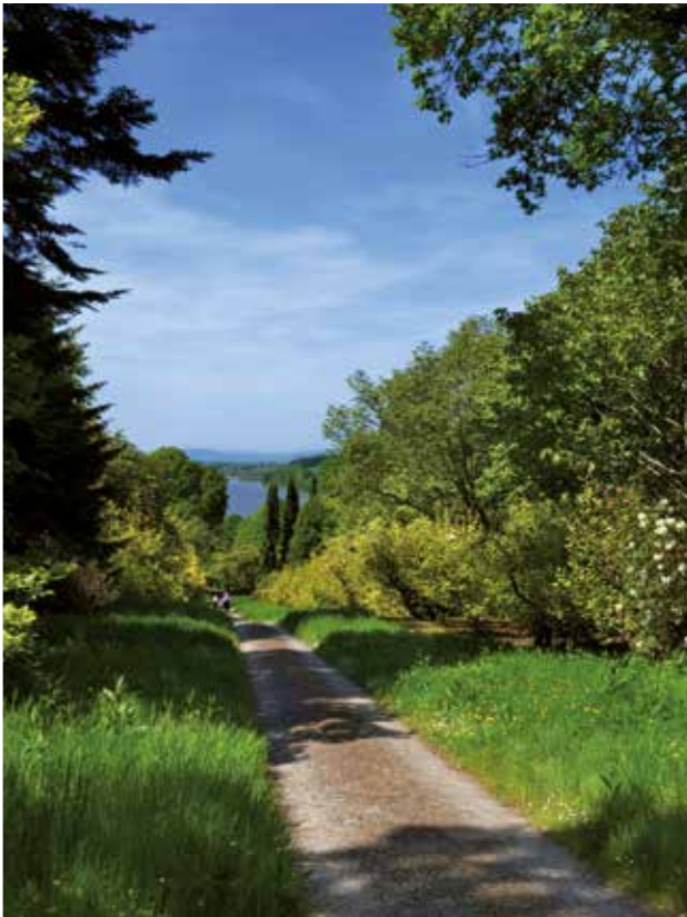
Mount Congreve Gardens