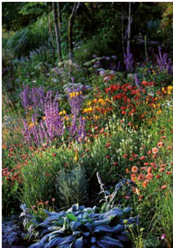
Hunting Brook Gardens