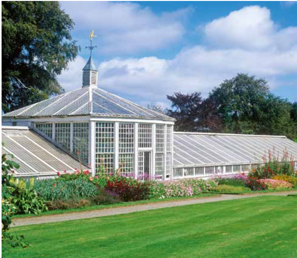
Mount Congreve Glass House