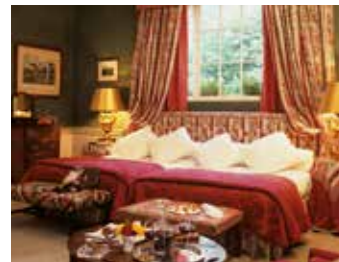
State Room – The Georgian Room