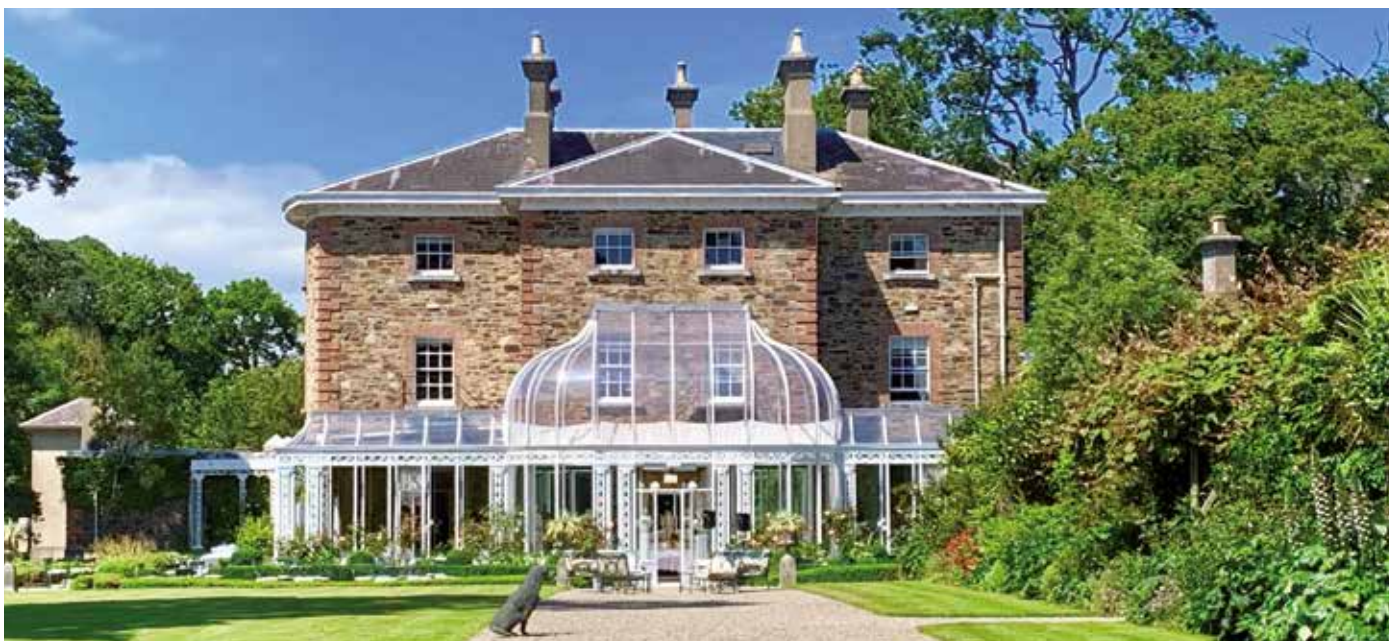
Exterior of Marlfield House