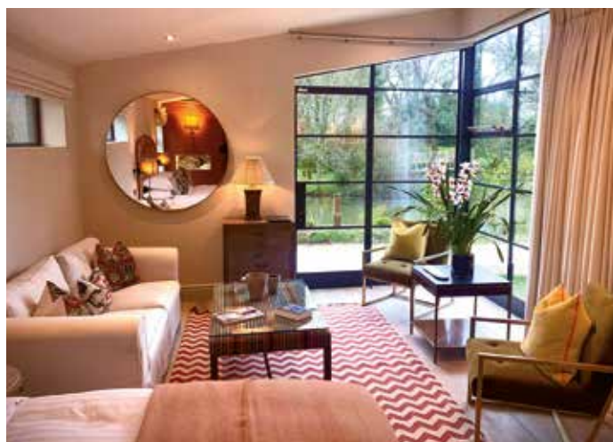
Pond Suites - The Fox Suite