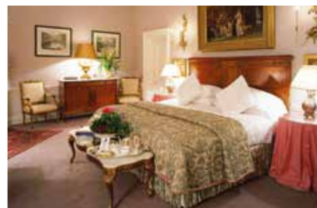
Junior State Room – The French Room