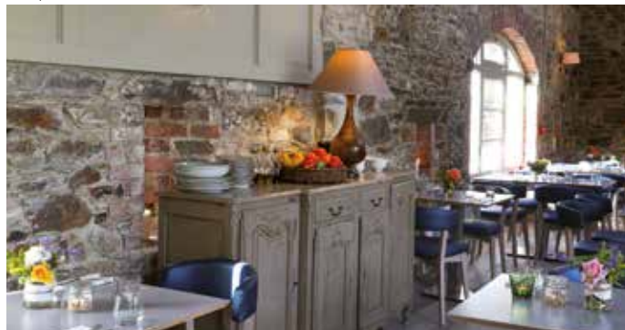
The Duck Restaurant