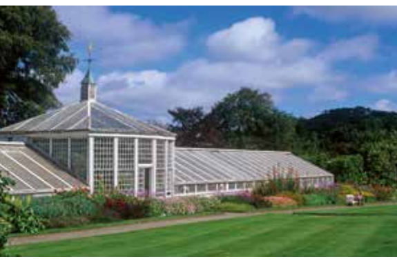
Mount Congreve Glass House