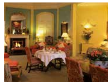
Master Suite – The Print Room