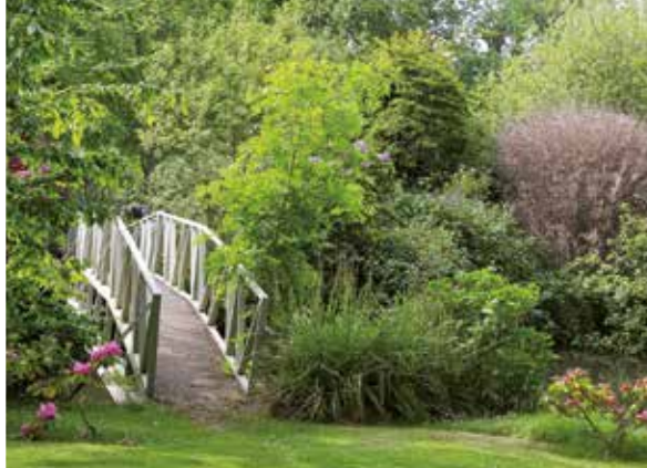
Hunting Brook Gardens