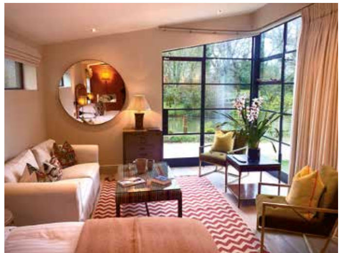
Pond Suites - The Fox Suite

The Lodge is a recently renovated luxurious contemporary two-bedroom cottage, located at the main entrance to the grounds. It features an open plan kitchen and living area with open fire, mini-bars, multi-channel TV's and Wi-Fi.