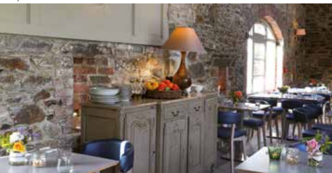
The Duck Restaurant