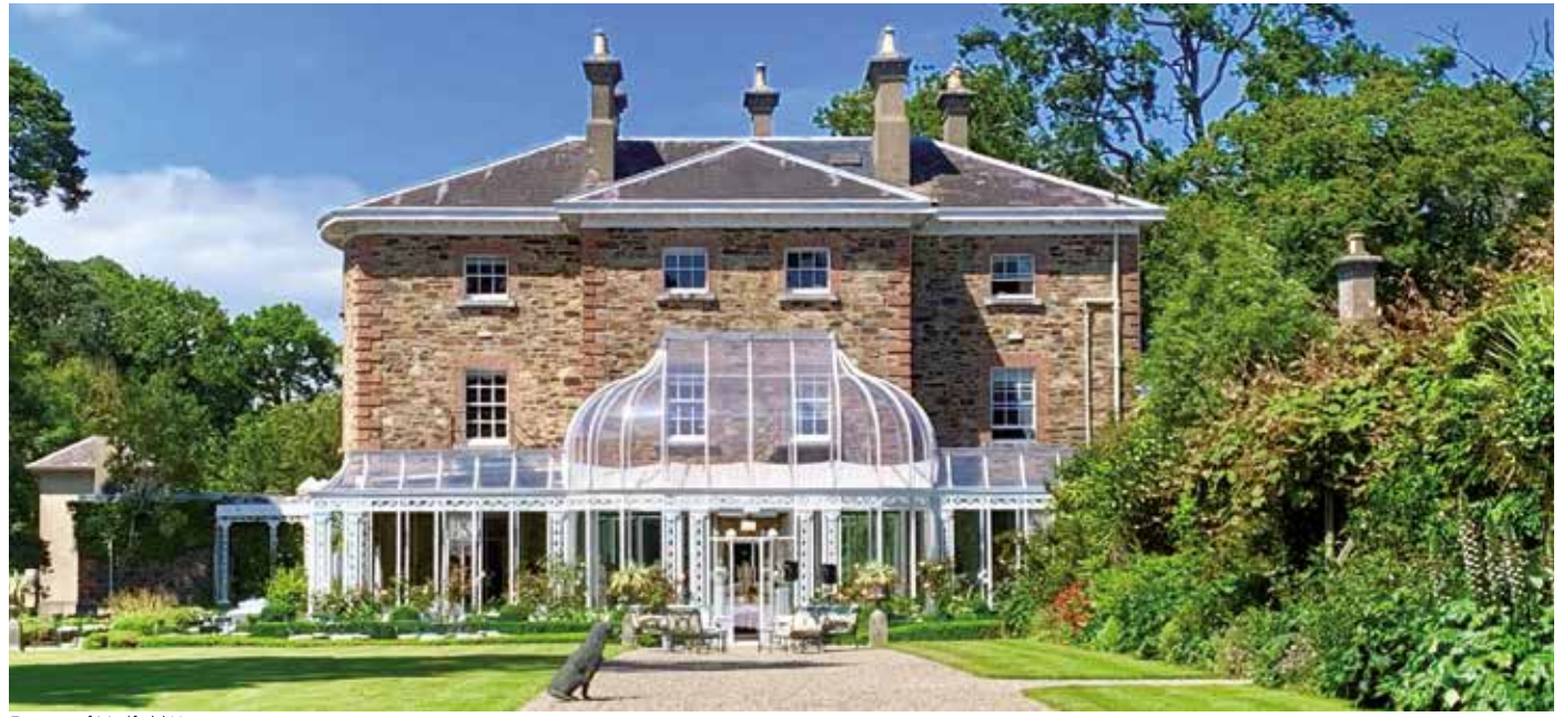
Exterior of Marlfield House