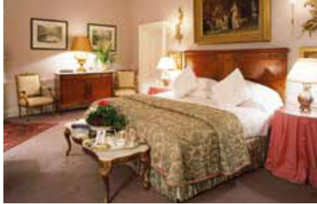
Junior State Room – The French Room