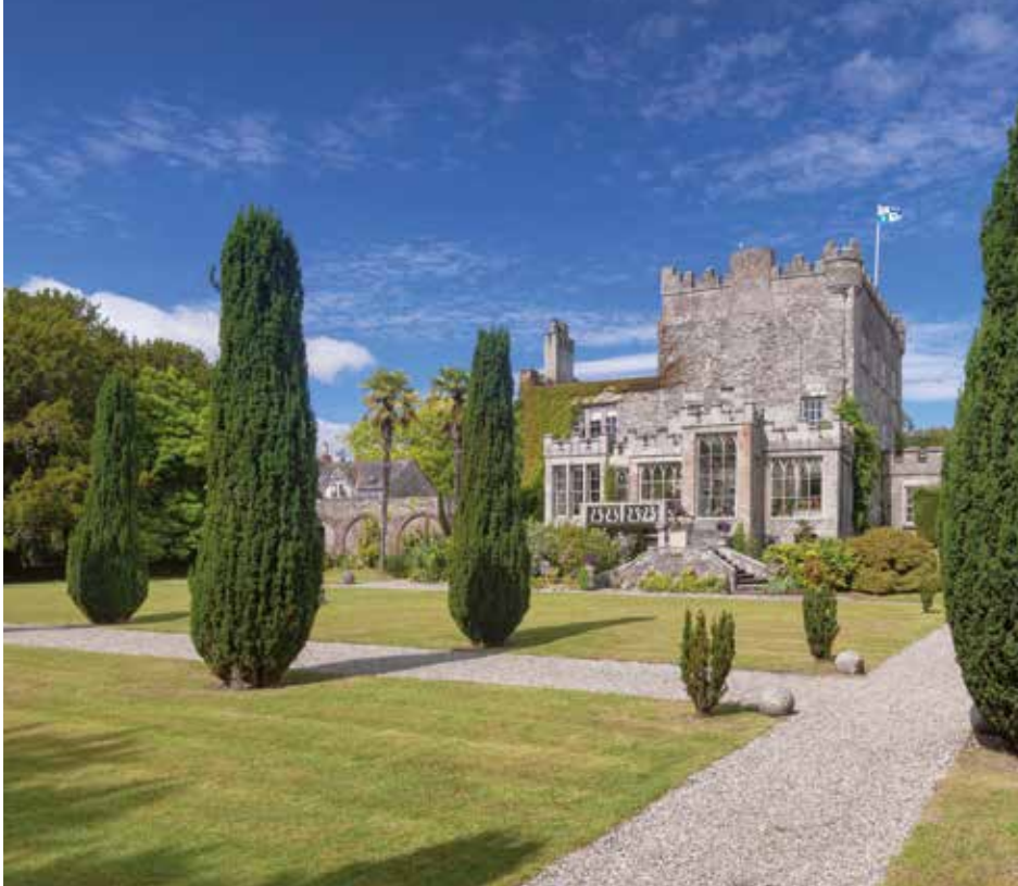
Mount Congreve Gardens