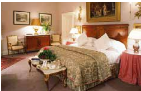
Junior State Room – The French Room