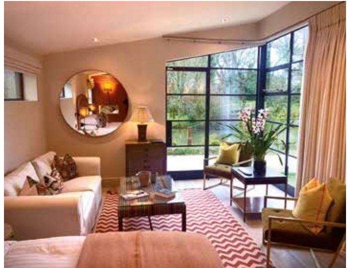
Pond Suites - The Fox Suite

The Lodge is a renovated luxurious contemporary two-bedroom cottage with open plan kitchen and living area with open fire, multi-channel TV's and Wi-Fi.