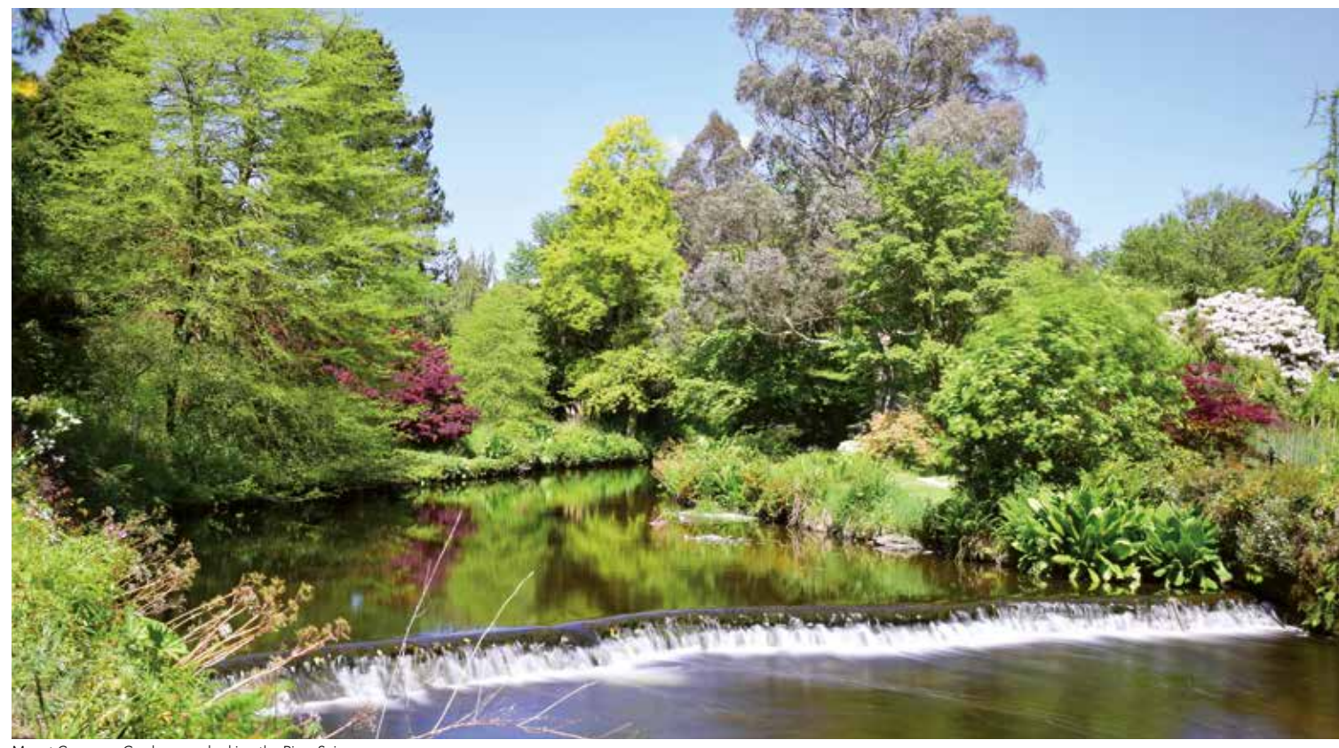
Mount Congreve Gardens overlooking the River Suir