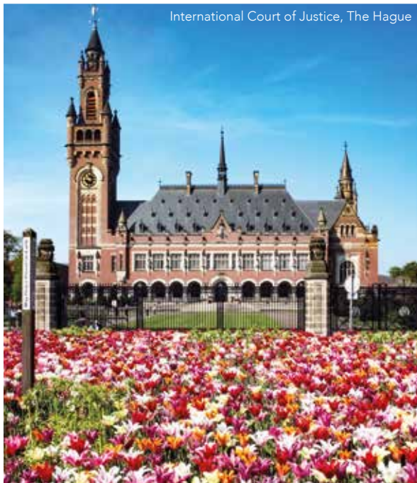
International Court of Justice, The Hague