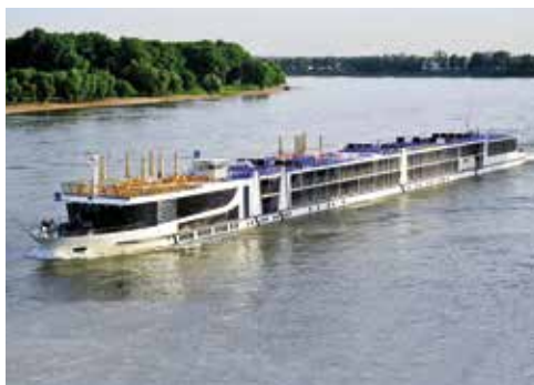
MS River Crown