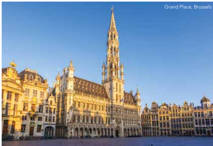
Grand Place, Brussels