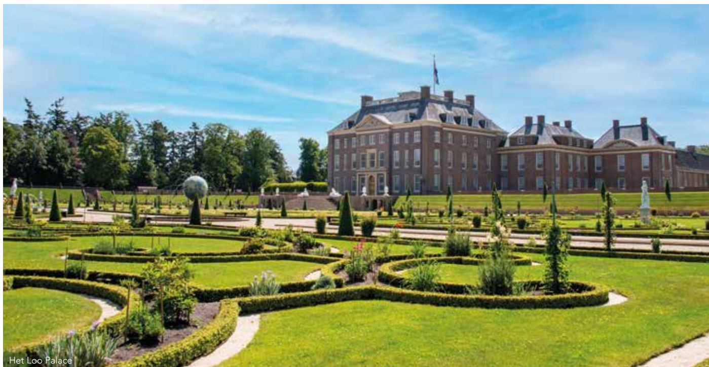
Het Loo Palace