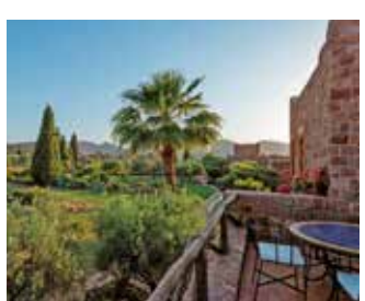
Superior Room Terrace