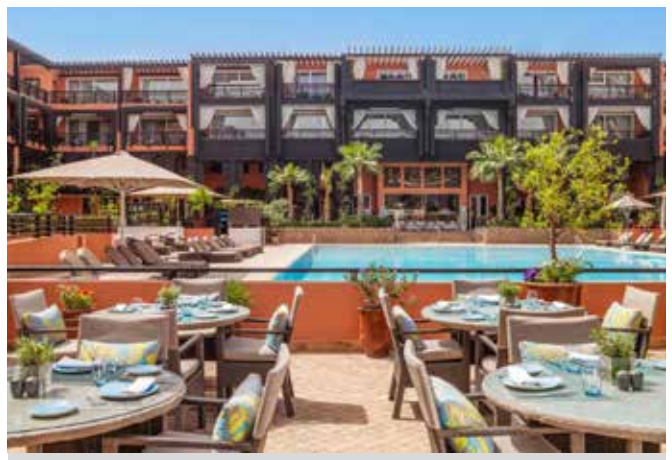
Le Naoura Barriere Marrakech

At the gates of the Medina and a few minutes from the souks and Jemaa El-Fna Square, Le Naoura Barriere offers absolute tranquillity in its beautifully landscaped gardens. The bright, welcoming interior design blends perfectly with the traditional styled architecture. The spacious bedrooms measure 46 square metres and blend Marrakech finesse with French luxury. The rooms are all equipped with modern comforts including TV, air-conditioning and Wi-Fi along with a private terrace. At the heart of the hotel sits a large heated outdoor pool, with luxurious padded sun loungers and parasols along with its spa and wellness centre where you can pamper body and mind. The property boasts two restaurants, the first offering French cuisine with a Moroccan twist and the second providing outside dining with Moroccan and Mediterranean dishes. The hotel's bar and lounge provide a chic setting for cocktails and light snacks. This wonderful hotel makes the ideal first stop in Morocco from which to rest and relax as well as explore Marrakech's prominent sights.