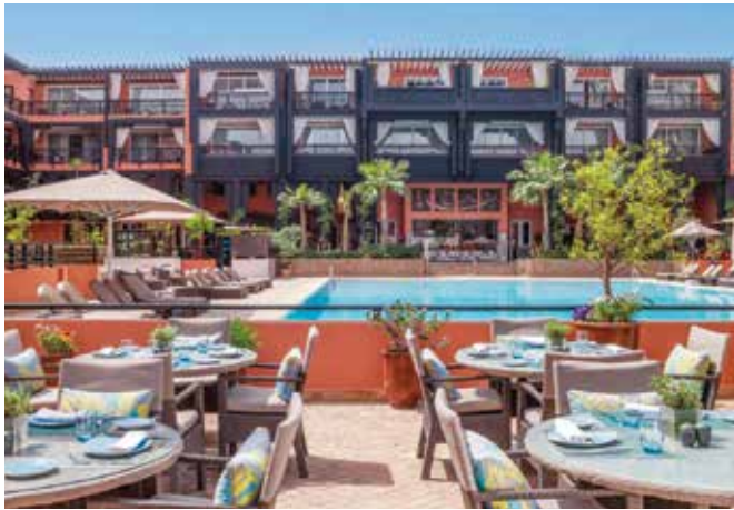
Le Naoura Barriere Marrakech

At the gates of the Medina and a few minutes from the souks and Jemaa El-Fna Square, Le Naoura Barriere offers absolute tranquillity in its beautifully landscaped gardens. The bright, welcoming interior design blends perfectly with the traditional styled architecture. The spacious bedrooms measure 46 square metres and blend Marrakech finesse with French luxury. The rooms are all equipped with modern comforts including TV, air-conditioning and Wi-Fi along with a private terrace. At the heart of the hotel sits a large heated outdoor pool, with luxurious padded sun loungers and parasols along with its spa and wellness centre where you can pamper body and mind. The property boasts two restaurants, the first offering French cuisine with a Moroccan twist and the second providing outside dining with Moroccan and Mediterranean dishes. The hotel's bar and lounge provide a chic setting for cocktails and light snacks. This wonderful hotel makes the ideal first stop in Morocco from which to rest and relax as well as explore Marrakech's prominent sights.