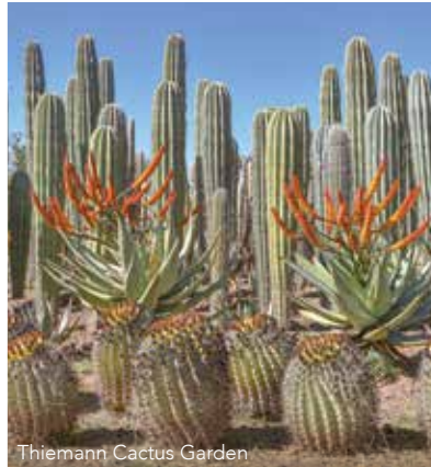
Thiemann Cactus Garden