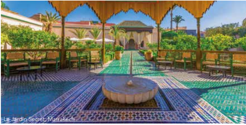
Le Jardin Secret, Marrakech