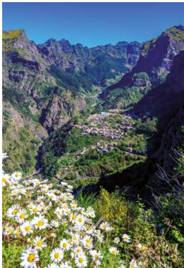
Curral das Freiras

Santana, famous for the traditional houses with thatched roofs before a stop for lunch at one of the nearby vineyards. As we make our way back to the hotel, we will stop at a viewpoint to enjoy the views from Porto da Cruz village on the way. The remainder of the day and evening are at leisure. (B, L)