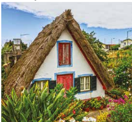
Traditional house in Santana