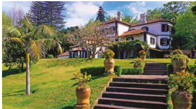
Quinta do Palheiro

Day 8 Madeira to London. Transfer to the airport for the return scheduled flight to London. (B)