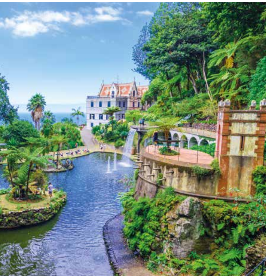
Monte Tropical Garden and Palace