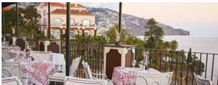
Villa Cipriani Restaurant