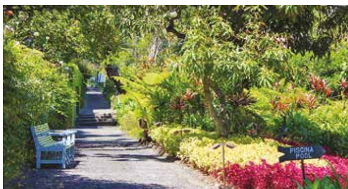
Gardens of the Belmont Reid's Palace

Day 7 Monte Palace Tropical Garden & Eira do Serrado. This morning we visit Monte, a charming village high in the hills overlooking Funchal.