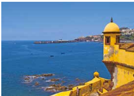
Fortress of Sao Tiago