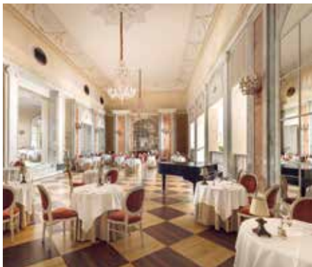
The historic Dining Room

Deluxe Sea View Rooms: These offer an average of 31 square metres of living space and are located in the most sought-after locations with balconies and great sea views. Please note that there are a limited number of Deluxe Sea View Rooms with walk-in showers and that these should be requested at time of booking.