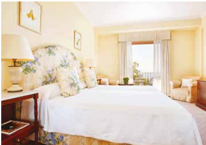
Deluxe Sea View Room