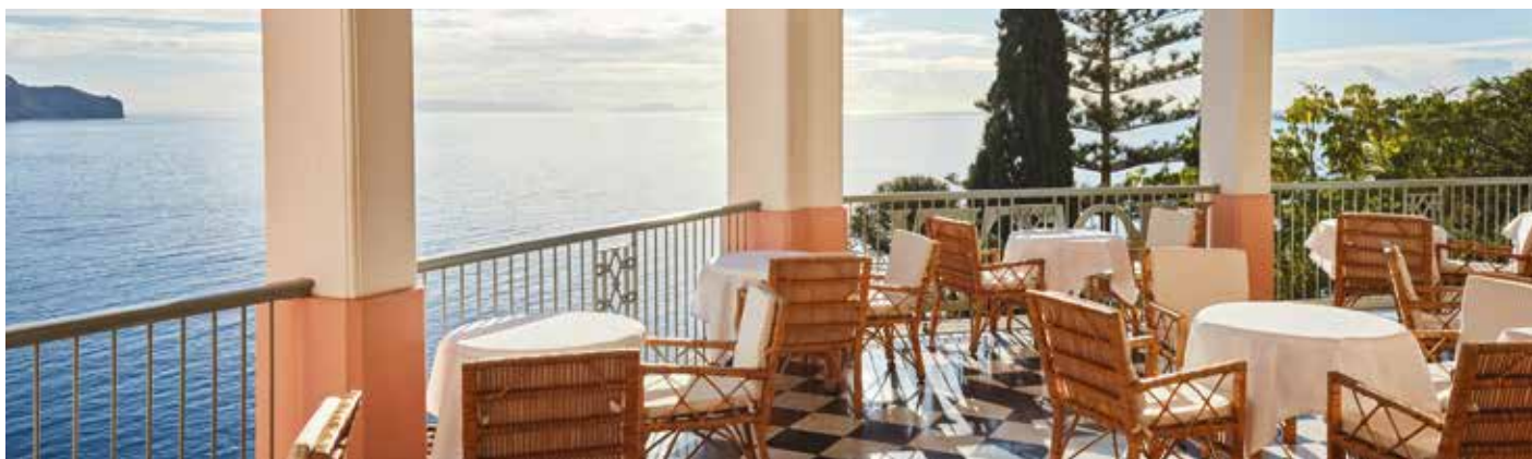
The Tea Terrace