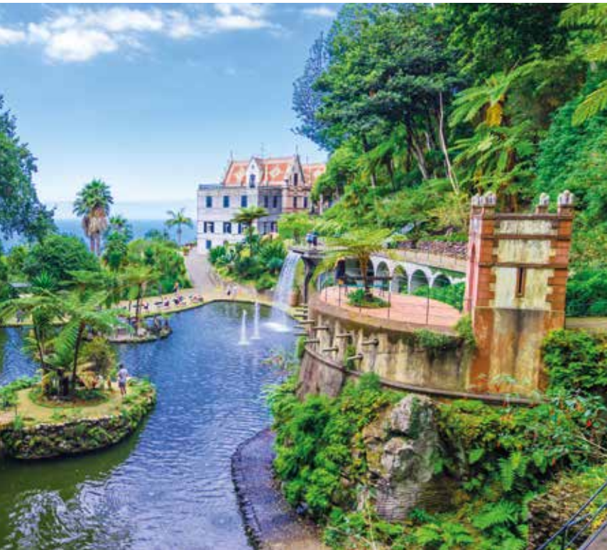
Monte Tropical Garden and Palace.