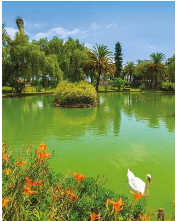
Lake and gardens of Santa Catarina Park, Funchal

does not permit the use of the outdoor areas, dinner will be held under cover on the ground floor of the fort). (B, D)