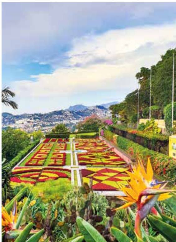
Botanical Garden, Funchal