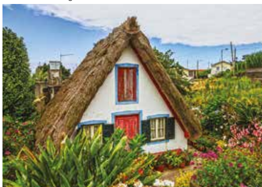
Traditional house in Santana