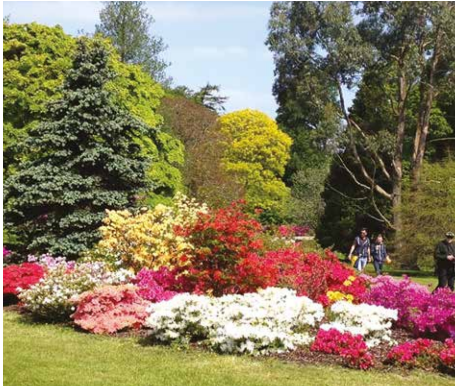
Azalea bed, Blarney