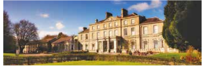
Faithlegg House Hotel

Tinakilly Country House is an elegant Victorian country mansion set in seven acres of beautifully landscaped gardens overlooking the Irish Sea in County Wicklow. The hotel was originally built by the British government in 1883 for Captain Robert Halpin, commander of 'The Great Eastern' and mariner supreme who laid 2600 miles of telegraphic cable in 1866, joining Europe to America. Each of the 51 luxurious and historic rooms features antique furniture, as well as cosy bathrobes, tea & coffee making facilities, ensuite bathrooms and satellite television. There is also complimentary Wi-Fi in the public areas. While Tinakilly House is a true reflection of the Victorian period, their kitchen prides itself on the fine blend of modern and traditional cuisine. Fresh fish, game and Wicklow lamb are provided locally and Tinakilly's own herb gardens supply the kitchen. The award-winning wine list features not only the traditional Bordeaux and Burgundies, but also a broad range of exciting new world wines, which gives their cellar a truly international flavour.