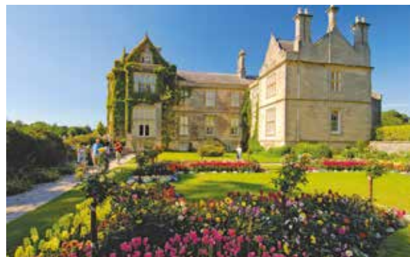
Muckross House and Gardens

past the sixteenth century Tower House to the walled garden and on down to Tourin Quay and the river Blackwater. In the afternoon we will visit Lismore Castle Gardens and Art Gallery. Dramatically situated on a rock overlooking the river Blackwater, this must be one of the most spectacular and romantic sites for a castle in Ireland. The castle has been home to Sir Walter Raleigh, Robert Boyle (father of Chemistry), Fred Astaire and owned by the Dukes of Devonshire since 1753. The garden is divided into two distinct areas. The upper garden which retains some of the original Jacobian style and more formal beds and the lower more informal garden. Ballymaloe House where we will stay for two nights is a family run hotel, with a lovely garden, café, craft shop and nearby cookery school of world renown.