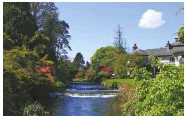
Mount Usher Garden and the Vraty River