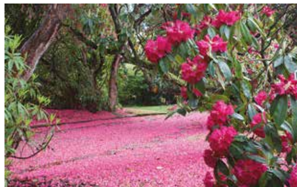
Broad walk, Kilmacurragh Gardens