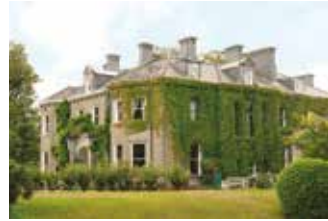
Tinakilly Country House