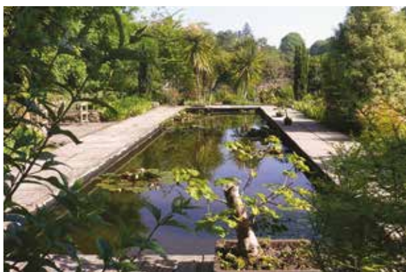
Fairbrook Gardens lilypond