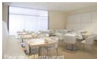
Fleur de Sel Restaurant