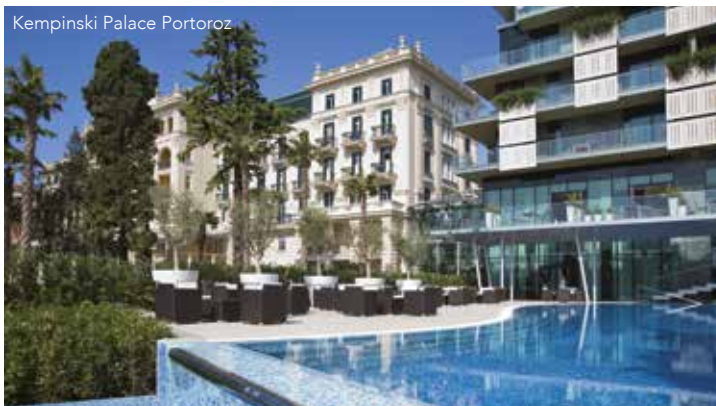
Kempinski Palace Portoroz