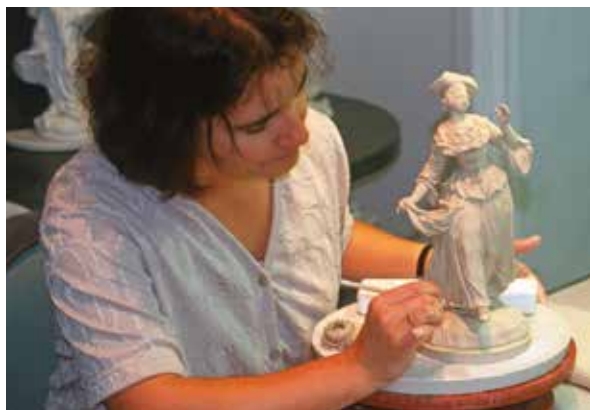
Meissen artist at work