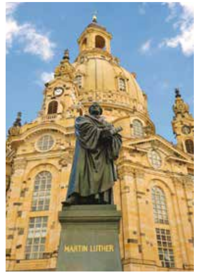
Martin Luther statue and the Frauenkirche, Dresden

Day 5 Meissen. After a relaxing morning spent sailing we will arrive at the beautiful city of Meissen with its enchanting Renaissance houses. During our guided tour we will visit the Meissen factory museum where fine porcelain has been produced since the early 1700s and see first-hand how this trademarked porcelain is created by hand.