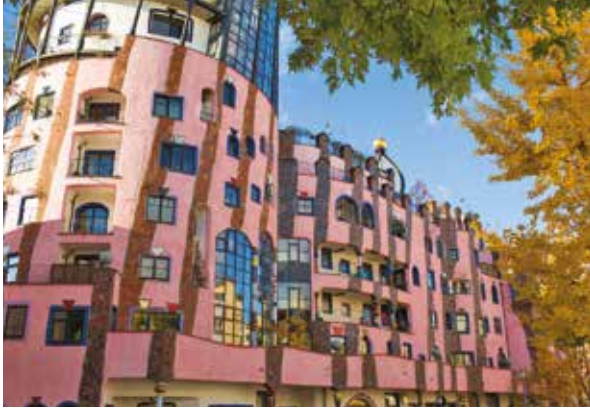
The Green Citadel, Magdeburg