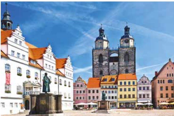
Market Square in Wittenberg Old Town