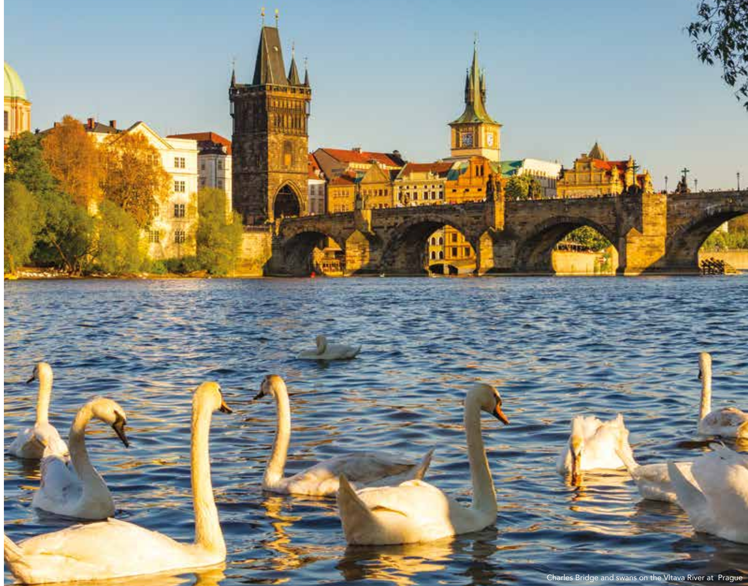
Charles Bridge and swans on the Vltava River at Prague