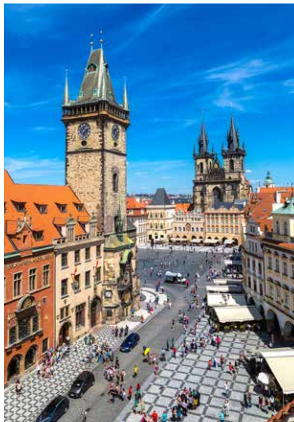
Old Town Square, Prague

Day 6 Wittenberg. Wittenberg was the home of Martin Luther and the centre of the Protestant Reformation. It was here at the Schlosskirche in 1517 that Luther nailed his 95 Theses in opposition to the Roman Catholic Church. On our half day excursion we will take a walk through the old town.