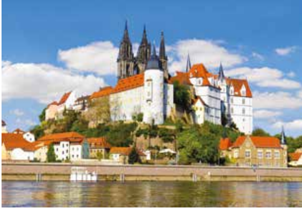
Albrechtsburg Castle and the Cathedral on the Elbe River at Meissen