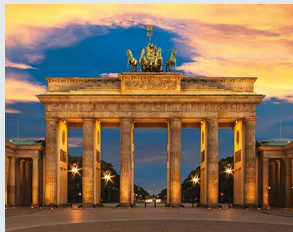
Berlin's imposing Brandenburg Gate

Not Included: Travel insurance, gratuities.