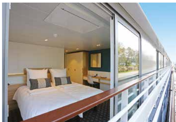
Upper Deck Cabin with French Balcony