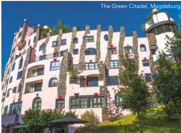
The Green Citadel, Magdeburg