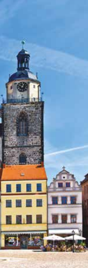
Old Town Square in Wittenberg Old Town