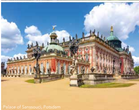
Palace of Sanssouci, Potsdam

which still shows signs of the Allied bombing during World War II. After lunch on board there will be the opportunity to explore this striking city independently.