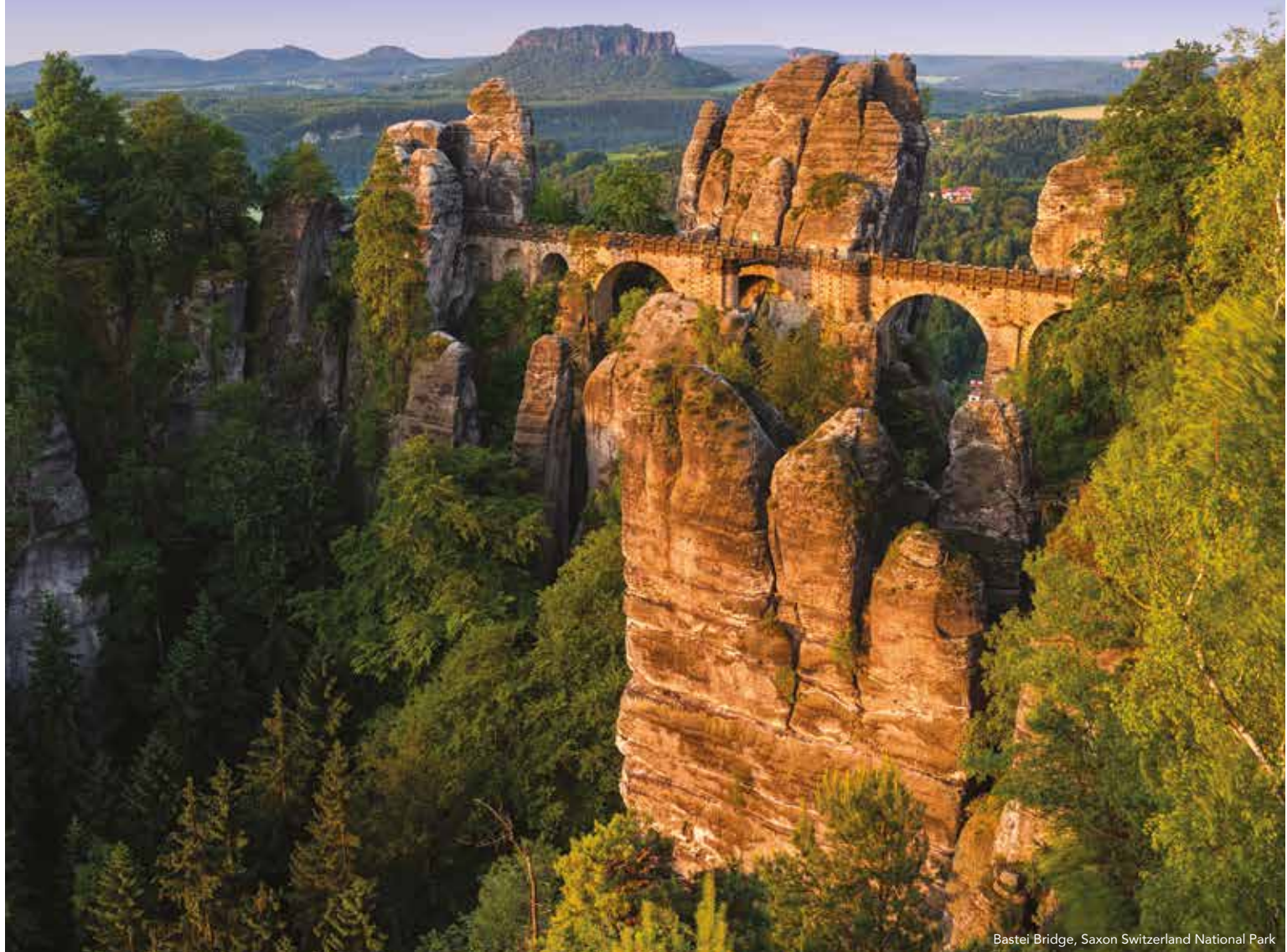
Bastei Bridge, Saxon Switzerland National Park

Our journey will take us from the vibrant city of Berlin to historic Magdeburg, Luther's hometown of Wittenberg, the famous porcelain town of Meissen, culturally rich Dresden and through the lovely Elbe Sandstone Mountains, where the river has cut a deep valley through sandstone rocks, ending in the graceful Czech capital of Prague. This is the perfect trip for those who enjoy seeing something different every day. Our floating hotel, the MS Elbe Princesse II transports you in considerable comfort between the two great cities of Berlin and Prague. The slow speed of the vessel allows you to absorb the changing landscape of town and country and observe everyday life along the river.