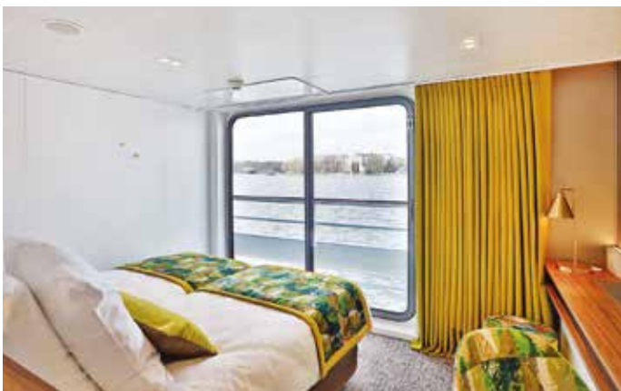
Upper Deck Cabin with French Balcony

Meals are taken in the single sitting restaurant on the vessel's Main Deck. The restaurant seats all passengers in an open seat arrangement and tables are arranged to seat groups of four, six and eight. Breakfast is served buffet style and features both hot and cold dishes, whereas dinner is served to your table with a choice of main course. Lunches served on board will be a combination of buffet style and table service. Cuisine is a selection of regional specialties and international dishes. Alcoholic and soft drinks are included in your holiday price (excluding premium brands) as are tea and coffee which are available throughout the day on a self-serve basis and with meals.