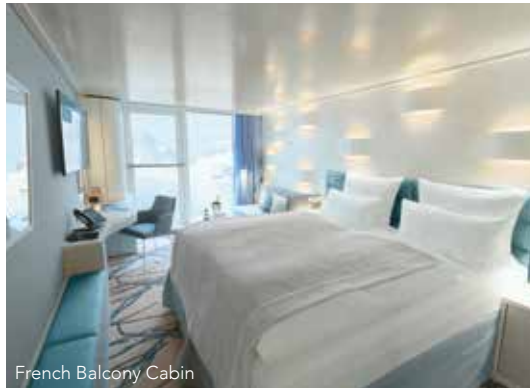
French Balcony Cabin