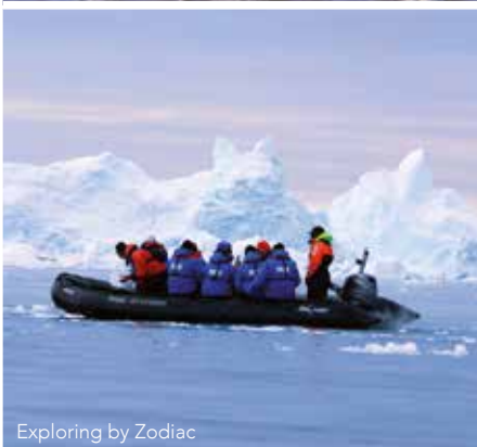
Exploring by Zodiac