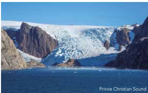
Prince Christian Sound