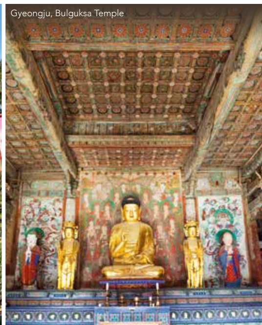
Gyeongju, Bulguksa Temple

Japan is a fascinating combination of unique heritage and culture contrasting with the sprawling metropolises of the world's most advanced technological civilisation. Made up of 6,852 islands, the perfect way to explore the 'Land of the Rising Sun' is by sea and the 118-passenger MS Island Sky is the ideal vessel for such a voyage. Our fascinating itinerary offers the opportunity to visit ancient castles, serenely beautiful gardens and opulent temples and shrines combined with witnessing some of Japan's most stunning natural landscapes and the futuristic city of Tokyo.