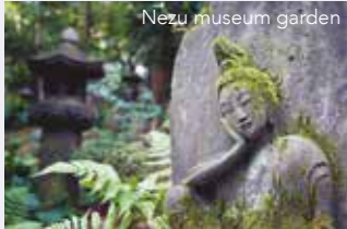
Nezu Museum garden

If you would like to spend some time in Tokyo before embarking the MS Island Sky we have arranged a two night extension.