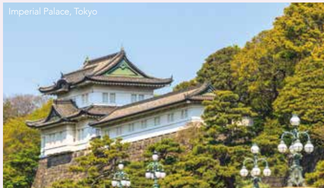
Imperial Palace, Tokyo

If you would like to spend some additional time in Tokyo, we are offering a two night pre-cruise extension.