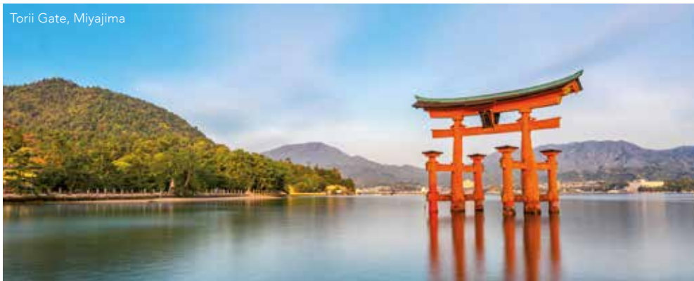
Torii Gate, Miyajima