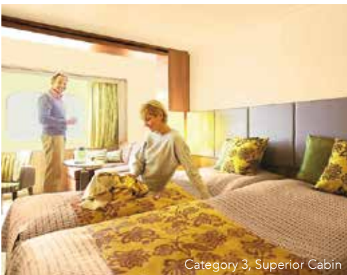
Category 3 Superior Cabin

The atmosphere on board is warm and welcoming, and the emphasis is on well-thought out itineraries, relaxation, time spent with like-minded passengers and discovery. There is an Open Bridge policy on board meaning you are welcome to observe the Captain and crew at work while enjoying some of the ship's best views. It is a fascinating place to learn about navigation and vessel operations, however, please note the Bridge will be closed when departing or arriving at port and at the Captain's request. You can join members of the onboard team and Guest Speakers in the Presentation Theatre for fascinating talks and presentations and whilst relaxing on board can unwind in the library, saltwater pool, well-equipped gym, enclosed hot tub, sauna and steam room or find a quiet place to enjoy a beverage. Watch your adventure unfold from numerous spectacular viewing locations including the Observation Lounge resplendent with 270-degree views, discover the relaxed atmosphere of the Bar and Lounge, or head outside to the teak decks of the open-topped Observation Deck and numerous weather protected locations including the expansive space aft of Deck 6. Informative port briefings from our onboard team, talks from our Guest Speaker and of course, good food with wine included at lunch and dinner, all contribute to make a voyage aboard the Heritage Adventurer a memorable and joyful experience.