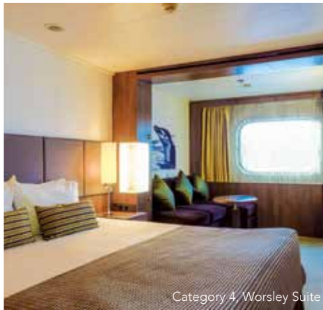
Category 4 Worsley Suite