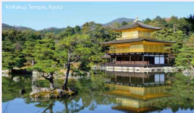
Kinkakuji Temple, Kyoto

If you would like to spend some time in Kyoto and discover the city of Nara, we are offering a two-night extension.