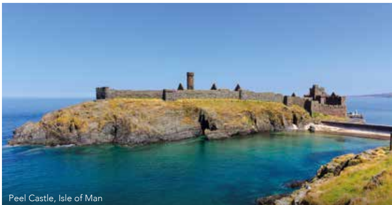
Peel Castle, Isle of Man