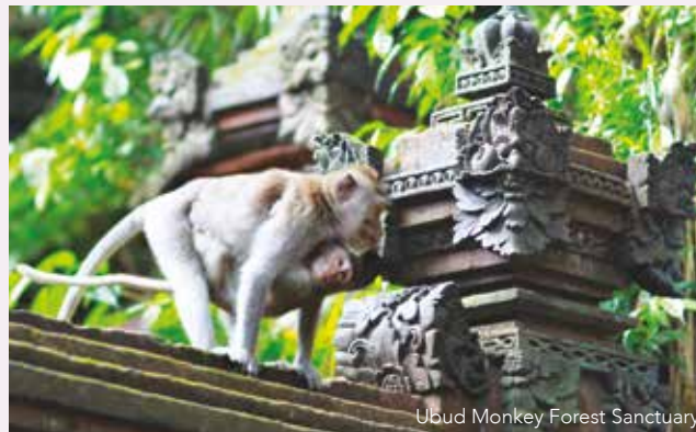
Ubud Monkey Forest Sanctuary

After disembarking the Heritage Adventurer you can extend your time on the island of Bali with our two night hotel stay in the charming town of Ubud in the uplands of Bali.