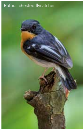
Rufous chested flycatcher

Day 14 London or Manchester. Arrive this morning.