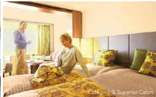
Category 3, Superior Cabin