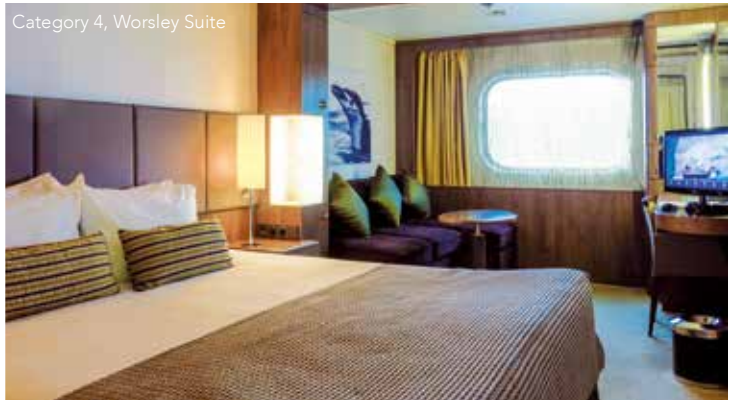
Category 4, Worsley Suite