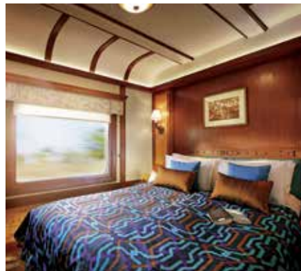
Deluxe Double Cabin