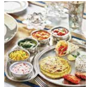
Food on board