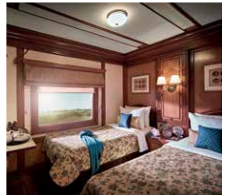
Deluxe Twin Cabin