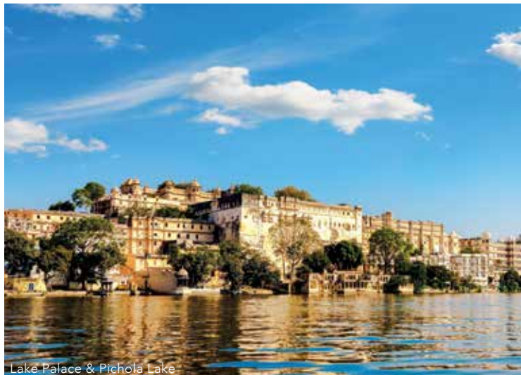
Lake Palace & Pichola Lake