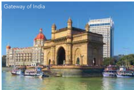
Gateway of India