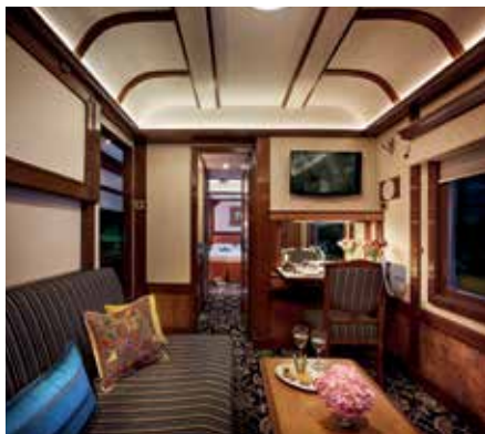
Presidential Suite Lounge