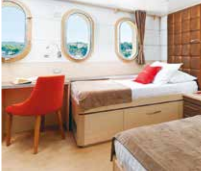
Cat 3 Twin Cabin