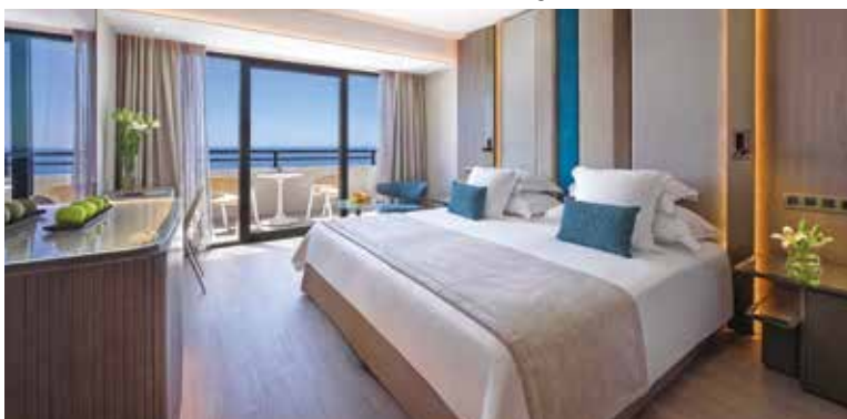
Superior Sea View Room