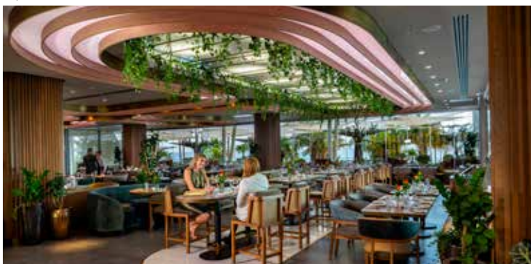
The Kalypso Restaurant