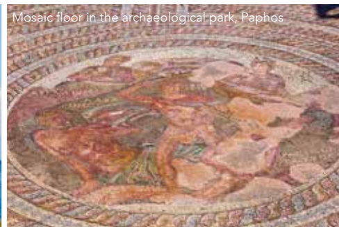
Mosaic floor in the archaeological park, Paphos