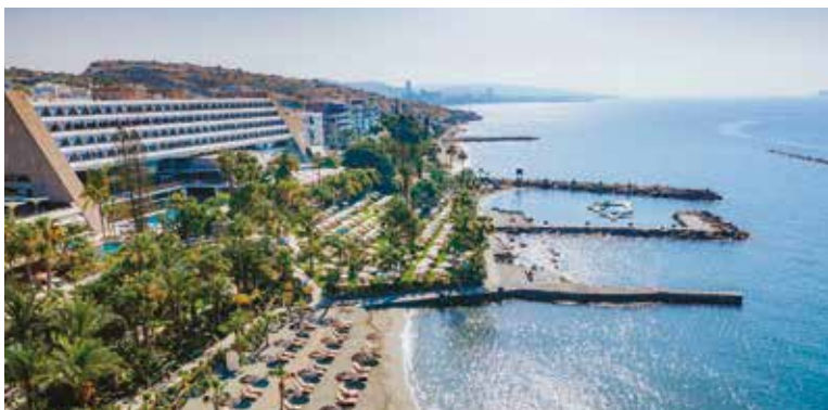
Amathus Beach Hotel

The hotel commands glorious sea views and has an indoor saltwater swimming pool and an outdoor freshwater pool, landscaped gardens and two beaches within extensive grounds. There is also a large fitness centre and Spa with sauna, steam bath and treatment rooms. The hotel offers a choice of restaurants and bars. The Kalypso Restaurant serves an extensive buffet breakfast with live cooking stations as well as an à la carte dinner, whilst The Grill Room offers prime steaks with commanding views of the Mediterranean. The Athina Lounge & Terrace is the perfect spot to unwind and relax with a large selection of cocktails, aperitifs and snacks as well as tea and coffee during the day.