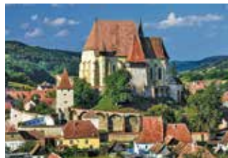
The Transylvanian Saxon village of Biertan

Day 12 Bucharest to London. Transfer to the airport for your return scheduled indirect flight to London. (B)