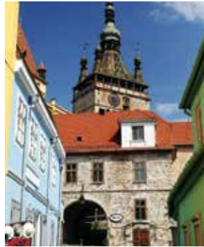
The Clock Tower of Medieval Sighisoara