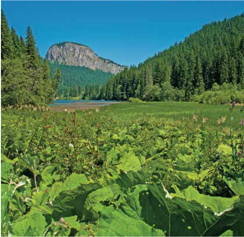
Red Lake (Lacu Rosu) near Bicaz Gorges