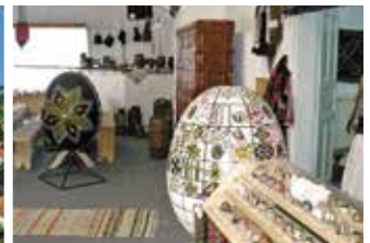
Painted Egg Museum at Ciocanesti