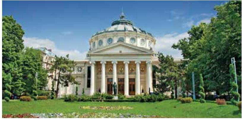
The Romanian Athenaeum, Bucharest