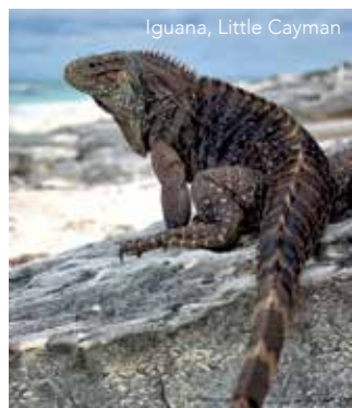
Iguana, Little Cayman

Fly by scheduled indirect flight. Arrive in Havana in the early afternoon and transfer to the MS Serenissima. Moor overnight.