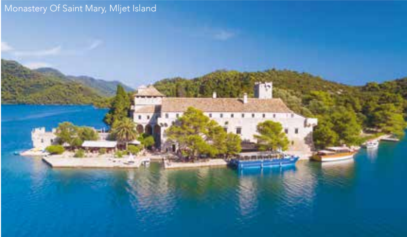
Monastery Of Saint Mary, Mljet Island