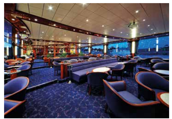
Lounge & Bar (prior to refurbishment)