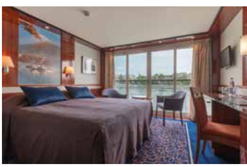
Premium Cabin with French Balcony (prior to refurbishment)