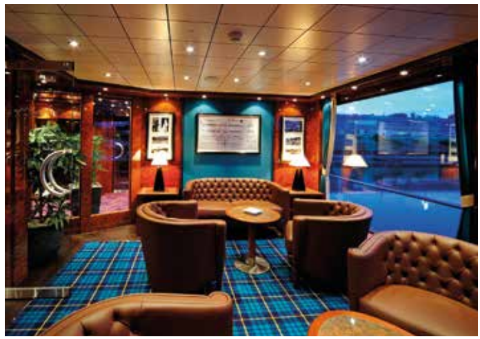
The Club (prior to refurbishment)