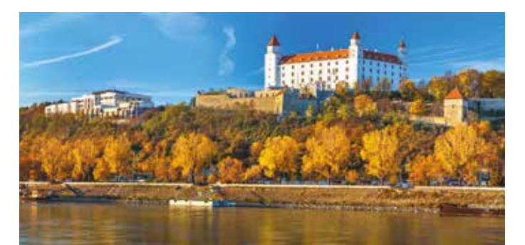
Bratislava Castle, Parliament and Danube River, Bratislava

Day 5 Christmas Day on the Danube. A relaxing day as we enjoy the good food and festivities of Christmas Day on board.