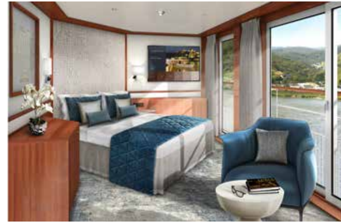
Illustration of Deluxe Cabin with French Balcony post-refurbishment