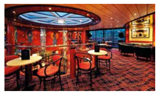
Atrium Lobby (prior to refurbishment)