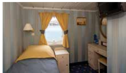
STANDARD SINGLE (7 to 12.5 square metres)