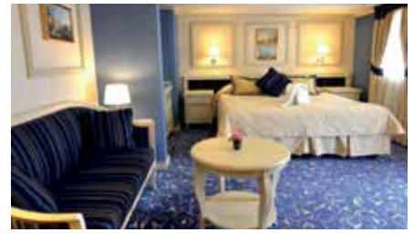
SERENISSIMA SUITE (25 square metres)