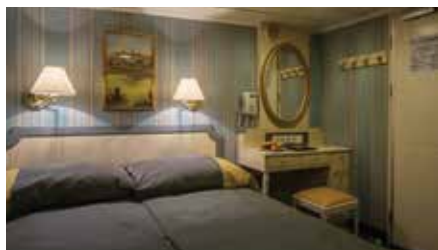
STANDARD STATEROOM (10 to 11.5 square metres)