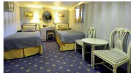
CLASSIC STATEROOM (14 to 19 square metres)