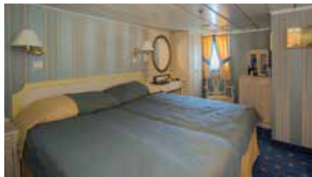
DELUXE STATEROOM (15 to 25 square metres)

NB. Please note cabin sizes vary in each category and measurements shown are approximate.