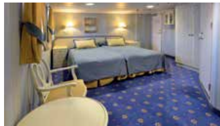
SUPERIOR STATEROOM (11.5 to 18 square metres)