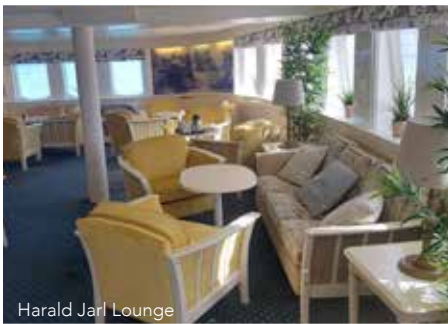
Harald Jarl Lounge