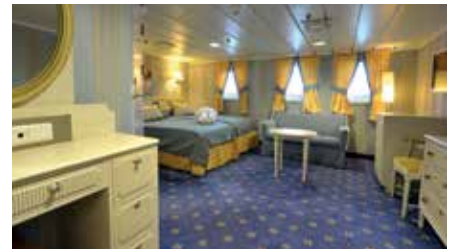
JUNIOR SUITE (21 square metres)

NB. Please note cabin sizes vary in each category and measurements shown are approximate.