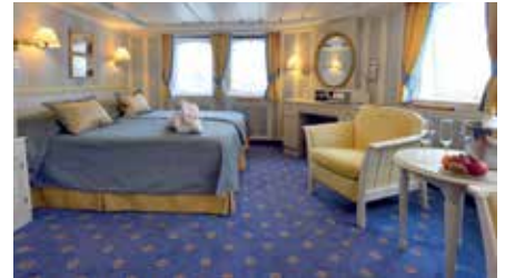
OWNER'S SUITE (22 square metres)