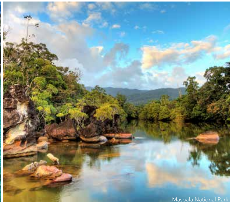
Masoala National Park

Celebrate Christmas and start the New Year with a voyage aboard the MS Serenissima in the warm waters of the Indian Ocean, discovering some of the most beautiful tropical islands on earth. Our two week journey combines some fascinating and exotic calls in Tanzania with stunning islands in the Seychelles along with the natural wonders of Madagascar. We know the region well having operated vessels there for the past twenty five years and if ever there was a region perfect for expedition cruising it is here, a timeless world of wonders both below and above the water. Our itinerary is perfectly suited to the MS Serenissima, her small size allowing us access to isolated ports and islands that are off limits to large cruise ships, and with our fleet of Zodiac landing craft we can reach the unreachable, landing on remote beaches, walking through verdant rainforest and national parks and getting close to some unique flora and fauna. Your experience will be made all the more memorable by our expert crew and officers who, along with our expedition team of marine biologists, ornithologists and botanists have many years of experience in the Indian Ocean.