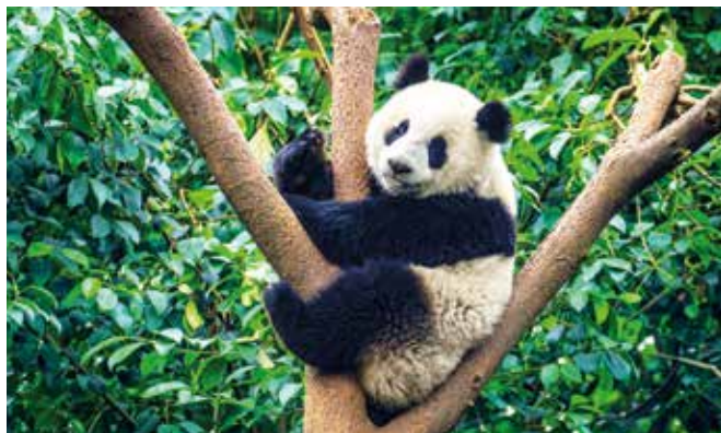
Giant Panda, Chengdu