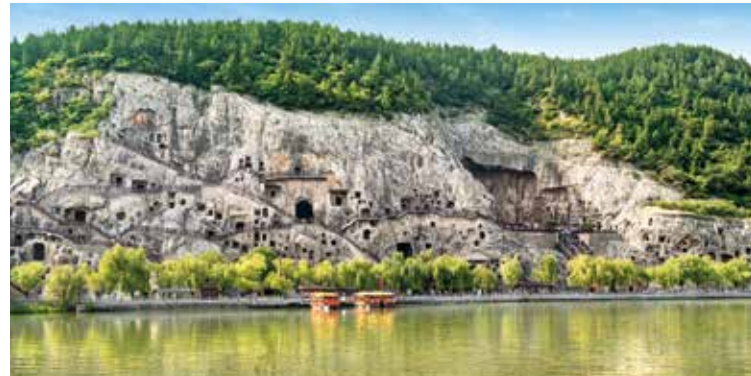
Longmen Grottoes, Luoyang

to see the legendary artistry that has withstood the sands of time. The experience is made even more special with an exclusive live performance by local folk musicians and dancers, their graceful movements and soulful melodies adding further memories to the visit. Following a leisurely lunch, the afternoon's adventure continues with a camel ride across the sweeping dunes of the Gobi. As we ride along the very paths once travelled by Silk Road merchants, the golden sands unfold towards our final destination: Crescent Lake. The enchanting desert oasis, nestled like a jewel beneath towering dunes, has miraculously endured for millennia. Its pristine waters reflect the afternoon sun, offering a moment of quiet awe in the heat of the desert – a perfect conclusion to a day steeped in history, legend, and enduring beauty.