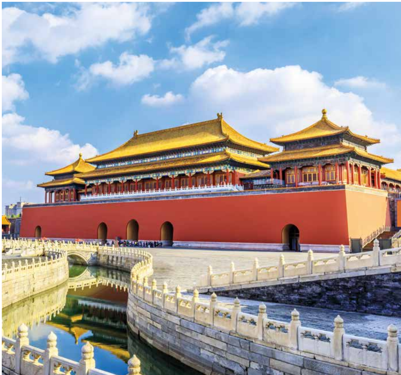
Forbidden City, Beijing