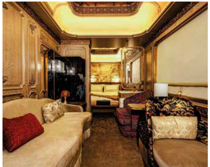
Han Dynasty Suite Lounge