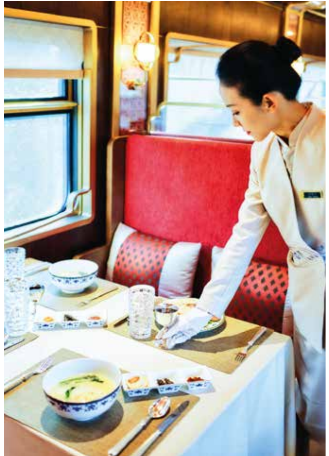
Unparalleled dining experience