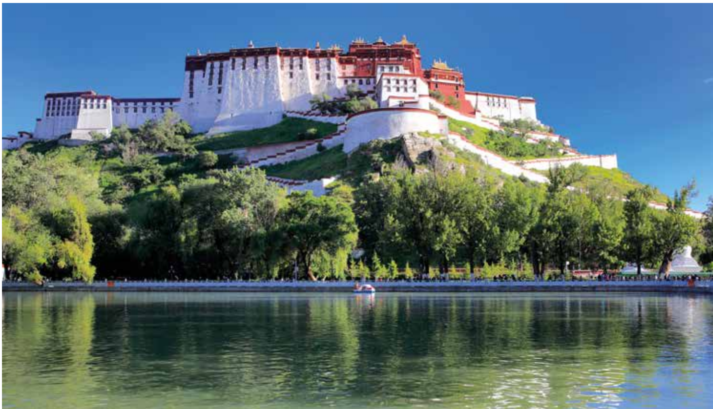
Potala Palace, Lhasa

in the 1740s as a retreat from the summer heat, this "Jewel Garden" enchants with its meticulously landscaped grounds, lotus-filled ponds, and a sense of stillness that contrasts beautifully with the city's liveliness. Strolling through this peaceful oasis offers a moment of reflection amid Tibetan heritage and artistry. For lunch, savour authentic Tibetan cuisine, richly flavoured with local herbs and accompanied by the sounds of traditional folk music. This afternoon, we ascend to the majestic Potala Palace, an awe-inspiring 17th century architectural masterpiece that once served as the winter residence of the Dalai Lama. Rising 300 metres above the valley floor, its towering red and white façade dominates the Lhasa skyline. Inside, labyrinthine corridors lead to ornate chapels, golden stupas, and sacred relics, each step a journey through centuries of spiritual and political history. As evening falls, we gather for a farewell dinner, raising a glass to the unforgettable moments of this extraordinary journey through the heart of China and Tibet.