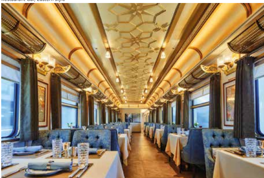
Restaurant Car, Western style