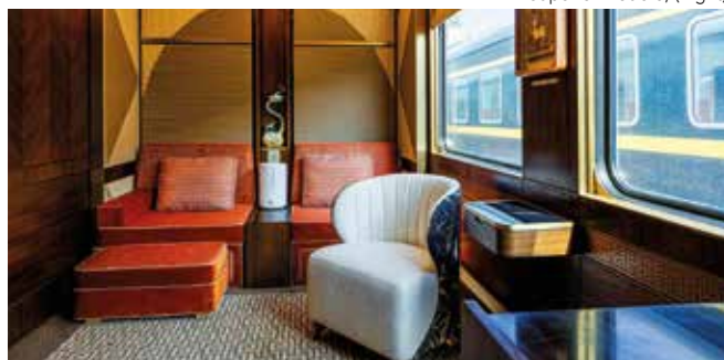
Superior Twin, (day)