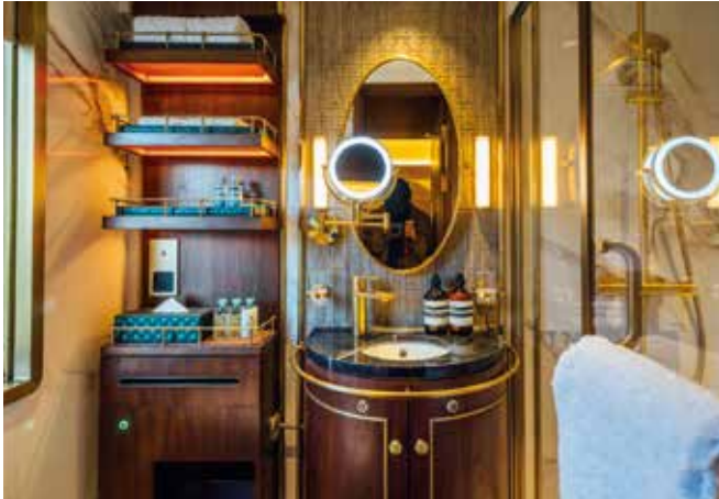
Superior Twin Restroom