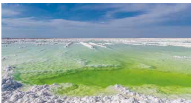
Chaerhan Salt Lake, Golmud