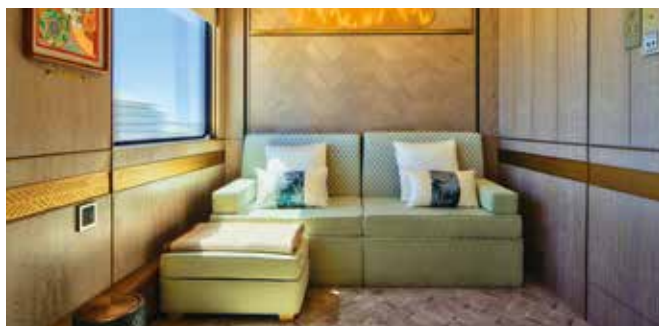
Superior Double, (day)