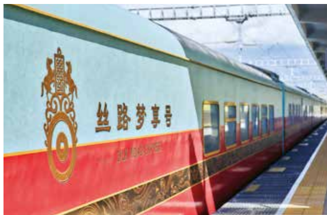
Golden Eagle Silk Road Express