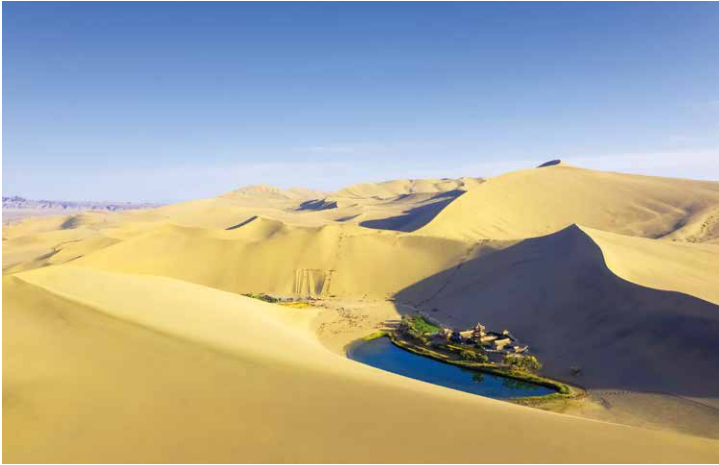
Crescent Lake, Dunhuang

Day 5 Kashgar. Today, we delve into Kashgar, a city that has long been a melting pot of cultures, religions, and architecture. Our exploration begins with a visit to the Apak Khoja Tomb, a stunningly adorned mausoleum considered the holiest Muslim site in Xinjiang. Wander through the Old Town, where narrow alleys and traditional homes provide a glimpse into local life, and explore the Gaotai folk houses, an area steeped in history and tradition. A wonderful lunch in a local restaurant introduces us to the diverse flavours of Uyghur cuisine before we return to the train to continue our eastward journey.