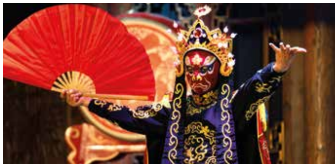
Sichuan Opera Theatre