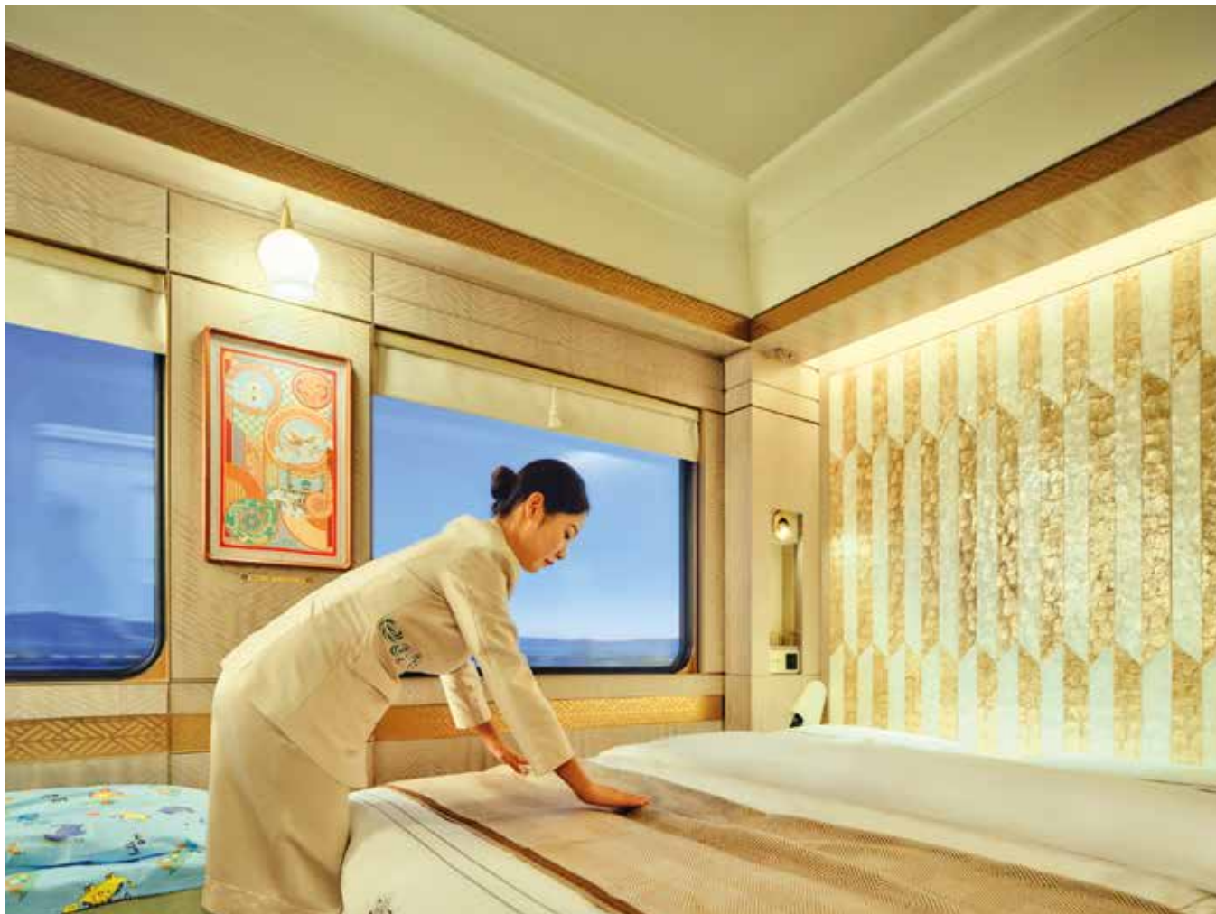
Superior Double, (night)