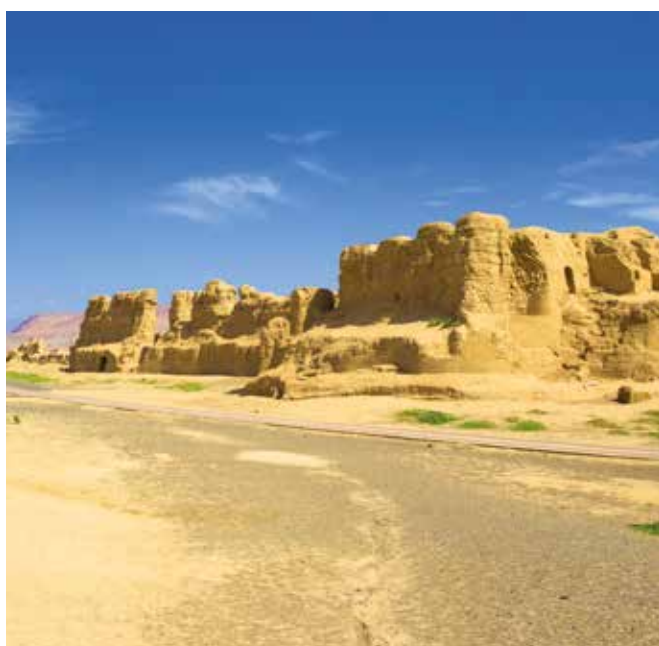
Ancient ruins at Gaochang