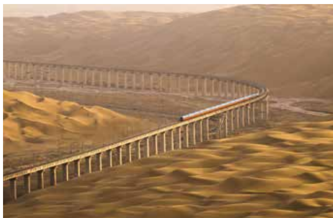
Golden Eagle Silk Road Express in the desert