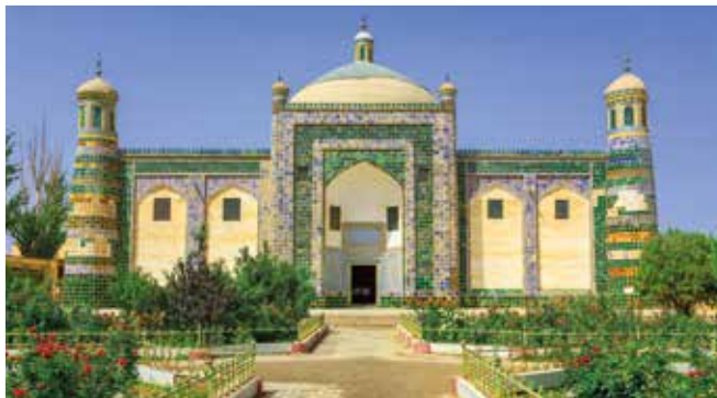
Apak Khoja Tomb, Kashgar

*Please note that the 2026 departure operates in the reverse direction to that shown from Beijing to Urumqi. Full itinerary can be viewed on our website.