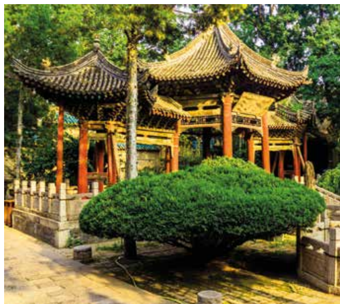
Pavilions at the Great Mosque, Xi'an