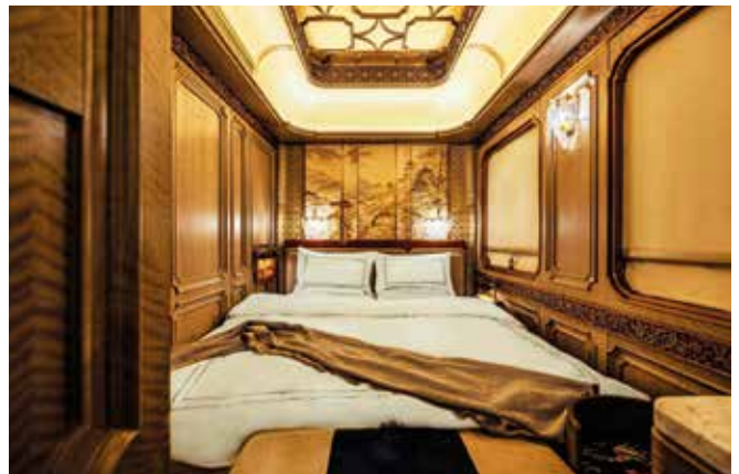
Han Dynasty Suite (night)