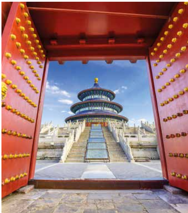
Temple of Heaven, Beijing