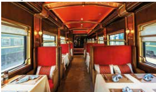
Restaurant Car, Eastern style