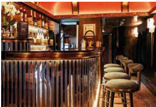
Bar Lounge Car