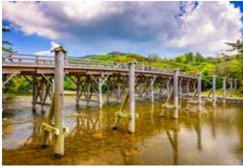
Uji Bridge at Ise Jingu Shrine