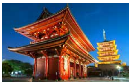
Sensoji Temple in Tokyo's Asakusa district

Day 12 Miyajima. This morning we take a full day excursion to Miyajima Island. Travel by tram through Hiroshima and take the ferry across to the island. We will spend all afternoon exploring the island including the World Heritage site of Itsukushima Shrine and the cable cars which go