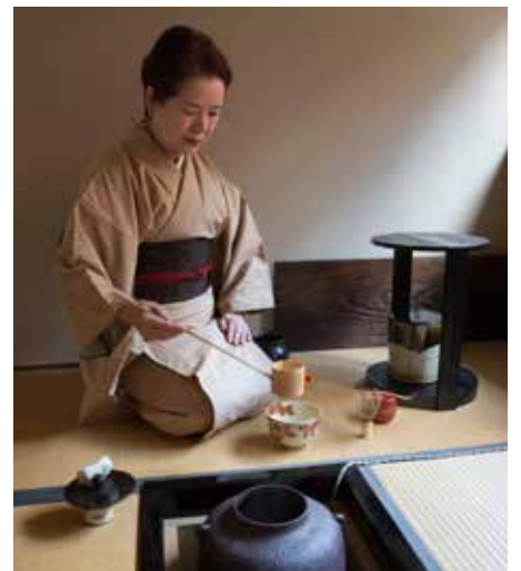
Tea ceremony, Kyoto