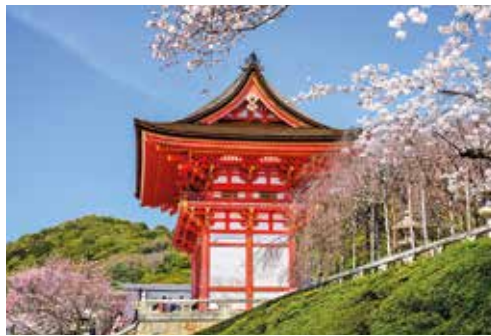
Kiyomizu-dera Temple, Kyoto