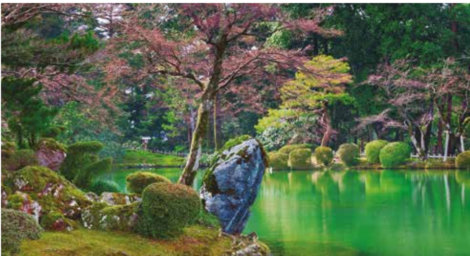
Kenrokuen Gardens, Kanazawa

Day 3 Kyoto. Enjoy a relaxing morning at leisure. Later we will embark on a guided sightseeing tour visiting Kyomizudera and the beautiful Kodaiji Temple with its famous garden. We also experience a traditional Japanese Tea Ceremony. This evening we will enjoy dinner at a local restaurant or alternatively, for an additional cost, you have the opportunity to stay in a traditional inn known in Japanese as a ryokan. The inn will be a traditional wooden building decorated with classic Japanese simplicity and you will sleep on thick futons. Dinner will be a feast of Kyoto 'Kaiseki'. A stay in a ryokan is an opportunity to experience the true essence of Japanese culture, refinement and service. Those taking this option will be escorted to the ryokan in the afternoon and picked up the following morning after breakfast.