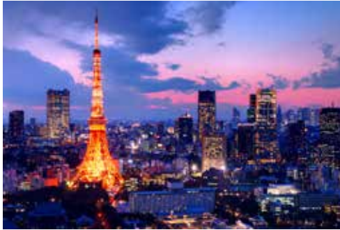
Tokyo Tower and the city