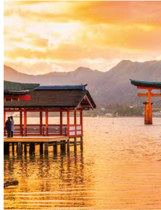
Torii Gate at Itsukushima Shrine, Miyajima

The cherry blossom (sakura) is Japan's unofficial national flower. It has been celebrated for many centuries and takes a very prominent position in Japanese culture. This, along with the many gardens, shrines and temples, makes spring the perfect season to glimpse some of the facets of modern Japanese life and cultural achievements.