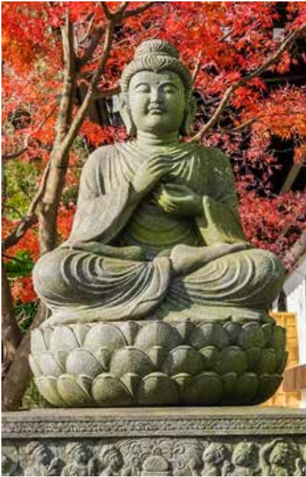
Buddha statue, Hasedera Temple