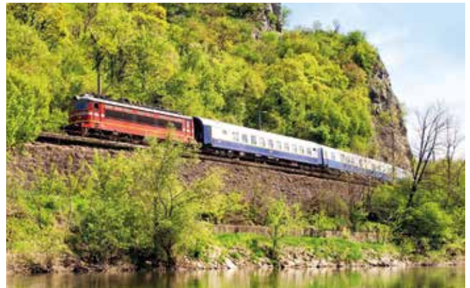
Golden Eagle Danube Express

The social heart of the Golden Eagle Danube Express is the Bar Lounge Car, a great place to relax and settle into the unhurried pace of life on board. Unwind in comfortable surroundings and watch the world go by as you get to know your fellow passengers or perhaps read a novel to while away the time. The Bar Lounge Car and Restaurant Cars also host an entertaining and enlightening range of activities and it is here that the Tour Manager will organise a programme of activities for the journey ahead. Daily itineraries detailing train arrival and departure timings and information on the following day's excursions and activities will be provided. As evening falls, you can enjoy the sounds of the resident pianist playing on the baby grand piano in the Bar Lounge Car.