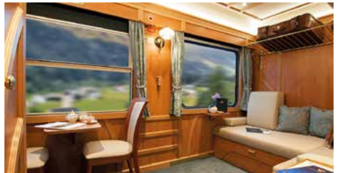
Superior Deluxe Class Cabin – Daytime Configuration