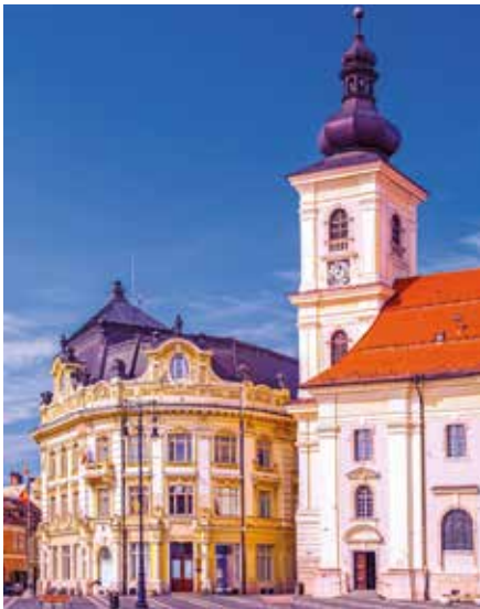
Council tower, Sibiu