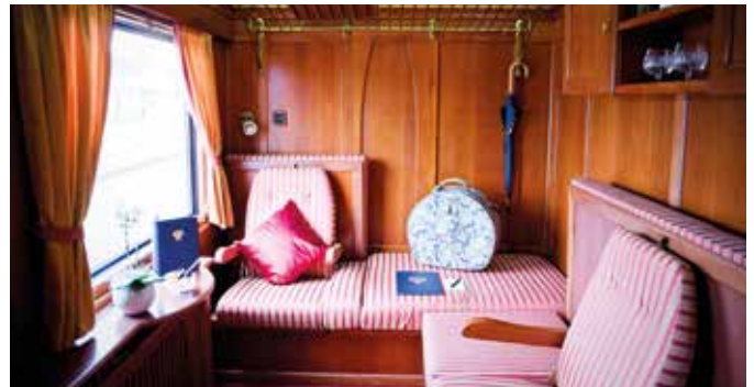
Deluxe Class Cabin – Daytime Configuration