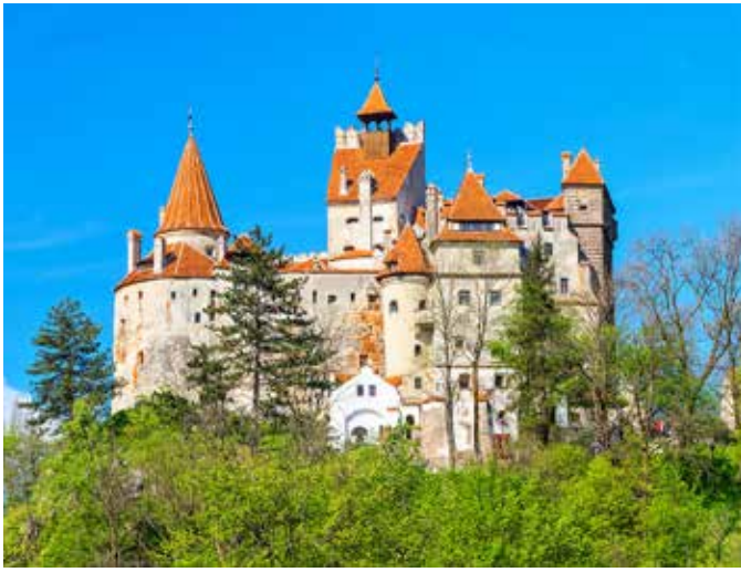
Bran Castle, Brasov