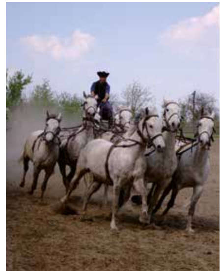
Puszta Horse Show

Day 4 Sinaia & Brasov, Romania. Overnight the train twists and turns as it climbs over the Carpathian Mountains and threads its way through the dramatic landscape with crystal clear mountain streams. This morning we arrive in Sinaia for a tour of Peles Castle. The castle is a masterpiece of German new-Renaissance architecture, considered by many one of the most stunning castles in Europe. Commissioned by King Carol I in 1873 and completed in 1883, the castle served as the summer residence of the royal family until 1947. Its 160 rooms are adorned with the finest examples of European art, Murano crystal chandeliers, German stained-glass windows and Cordoba leather-covered walls. Returning to our private train for lunch we continue onto Brasov in the afternoon for a visit to Bran Castle. Surrounded by an aura of mystery and legend and perched high atop a 200-foot-high rock, the 14th century castle owes its fame to its imposing towers and turrets as well as to the myth created around Bram Stoker's Dracula. Following a tour of the castle and its surroundings we will enjoy a gala dinner.