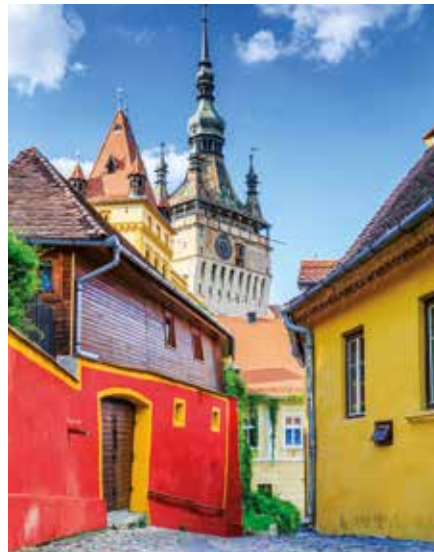
The Clock Tower, Sighisoara