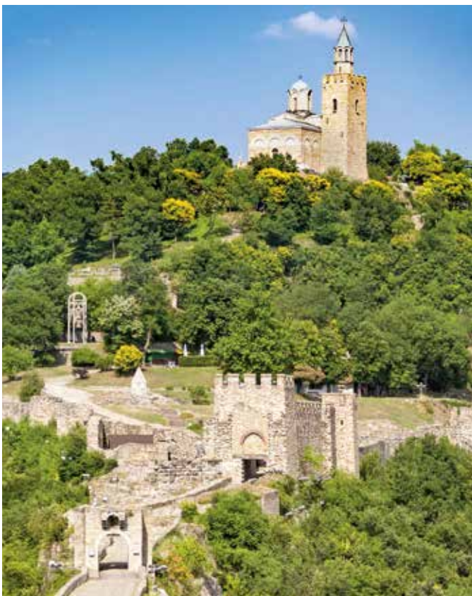
Tsarevets fortress, Veliko Tarnovo

Discover the rich tapestry of cultures, fairy-tale castles and dramatic landscapes of Transylvania on this exceptional journey. Following an overnight stay in Istanbul, with time to explore the city's highlights, we join the Golden Eagle Danube Express for this journey through the heart of southeast Europe. En route, visit the ancient Bulgarian capital of Veliko Tarnovo, the legendary Peles Castle and Bran Castle, and the Medieval Transylvanian cities of Sighisoara and Sibiu, each offering fascinating insights into the region's rich heritage and striking mountain scenery. Our journey concludes as we cross the Great Hungarian Plain and arrive on the banks of the Danube, where we will enjoy an overnight stay in the grand city of Budapest in a five-star hotel.