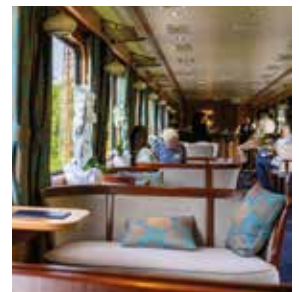
Bar Lounge Car