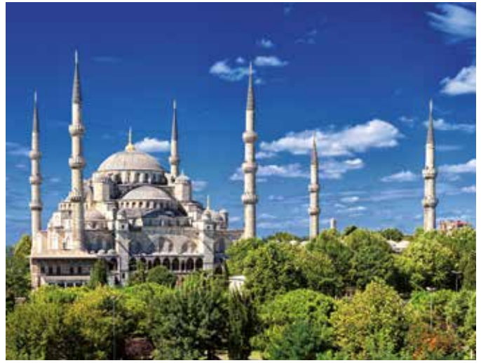
Blue Mosque, Istanbul