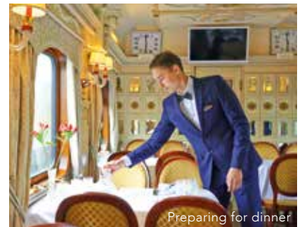
Preparing for dinner