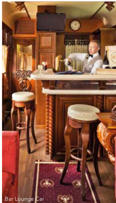
Bar Lounge Car

Throughout the journey, you can expect a service which is attentive, friendly and unintrusive. Your car attendants provide 24-hour housekeeping and bedding turndown services and the Train Tour Manager is there to co-ordinate all of the elements and to assist you as required. There is a Wi-Fi service on board though coverage is limited and will usually only be available as we pass through larger cities and towns. However, the aim is to provide internet access in a local hotel or restaurant for guests at least every other day.