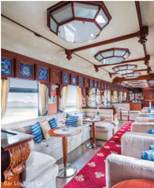
Bar Lounge Car