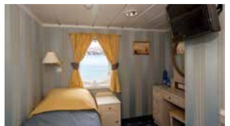
STANDARD SINGLE (approx. 7 to 12.5 square metres)