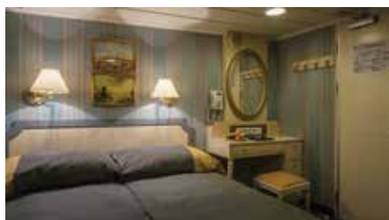
STANDARD STATEROOM (approx. 10 to 11.5 square metres)