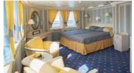
OWNER'S SUITE (approx. 22 square metres)