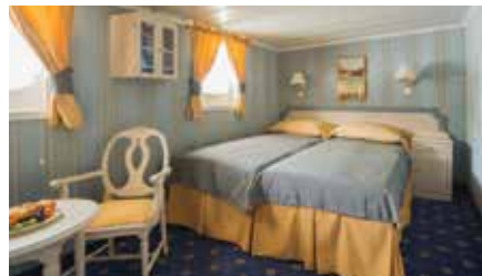
SUPERIOR STATEROOM (approx. 11.5 to 18 square metres)