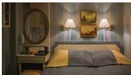
INSIDE TWIN/DOUBLE (approx. 10 square metres)