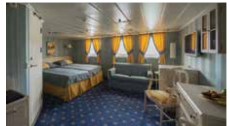
JUNIOR SUITE (approx. 21 square metres)