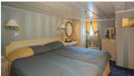
DELUXE STATEROOM (approx. 15 to 25 square metres)