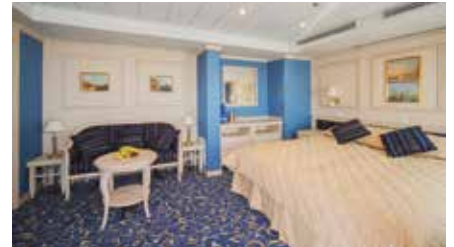
EXECUTIVE SUITE (approx. 25 square metres)