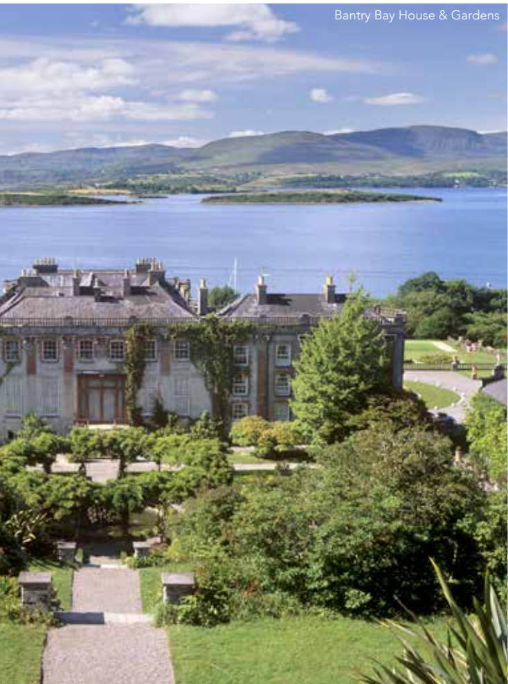
Bantry Bay House & Gardens