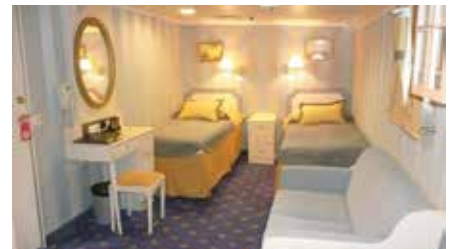
STANDARD STATEROOM PLUS (approx. 14 to 19 square metres)