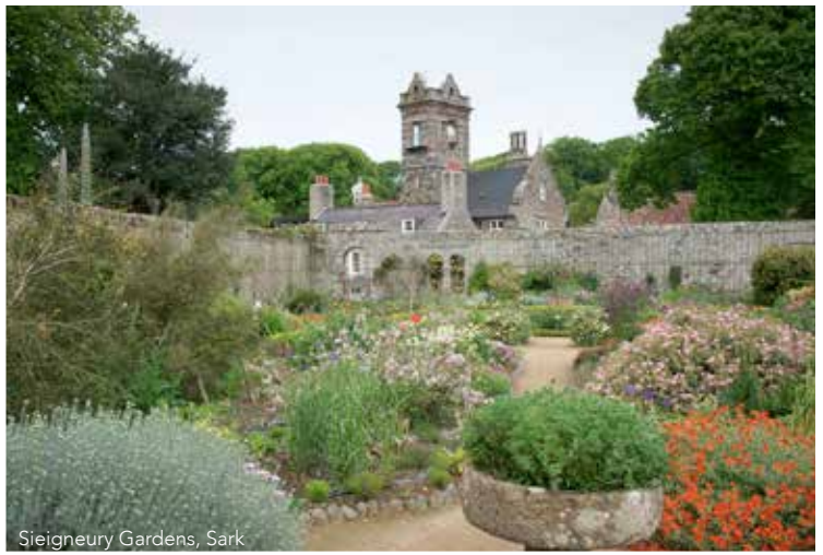
Sieigneury Gardens, Sark