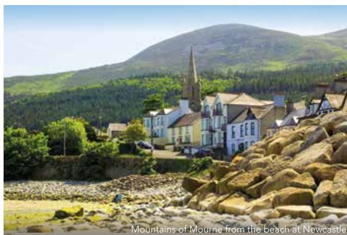
Mountains of Mourne from the beach at Newcastle

and there will be options to visit the Cape Clear Bird Observatory, the Heritage Centre with archive information on the island, or to join a series of island walks where we may see some of the active birdlife and enjoy the views over the Atlantic. Later we hope to use the Zodiacs to land at the quaint village of Schull from where we will take the road to Mizen Head, the most southwesterly point of Ireland. Here we find the famous signal station and there will be a choice of walks, all offering stunning views along the west coast and a great chance to see kittiwakes, gannets and choughs as well as seals on the rocks below. Those feeling active may also want to climb down to the Keeper's Quarters including displays on the Fastnet lighthouse, the Marconi radio room and the bird mural room, home to a spectacular mural by Jules Thomas showing the birds of the Mizen peninsula, their habitats, nests and eggs.