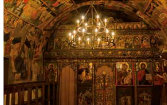
Nativity of Christ Church, Arbanasi

B ulgaria provides a captivating mix of scenic beauty and cultural diversity that is hard to match. From beautiful cities to untamed landscapes, mist-shrouded plains and soaring mountain peaks, our new escorted tour will provide an opportunity to discover one of Europe's best secrets. Founded in the 7th century, Bulgaria is one of the oldest states in Europe and having sat at the crossroads between so many cultures and influences, it possesses a rich historical legacy. Whilst most tourists flock to the Black Sea resorts, our in-depth exploration will instead venture into the heart of this ancient land where we will discover a wealth of marvellous sites including golden-domed churches, Thracian tombs, monastic retreats and historic cities and towns.