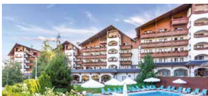
Hotel Kempinski Grand Arena

The Ramada Trimontium Hotel is located in the centre of Plovdiv making it ideal for sightseeing. Its location next to the city gardens also offers beautiful and calming surroundings. The hotel has an indoor and outdoor pool, sauna and gym as well as two restaurants and a bar. The newly renovated rooms offer all mod cons including television, air-conditioning and toiletries.