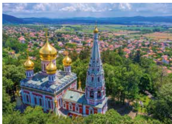
Shipka Memorial Church