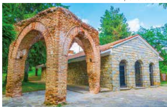
Thracian tomb, Kazanlak

belonged to the Thracian King Roigos. The unique Hellenistic frescoes are one of the highlights of the impressive tomb. After our visit we continue to a local rose oil distillery. Bulgaria is one of the biggest rose oil producers, which is celebrated in its annual rose festival each year. Learn about how they grow the roses and produce the fragrant oil. After lunch we visit a second Thracian Tomb in Starosel, which dates to the 6th century BC and was partially excavated in 2000. The temple sits on a hill offering beautiful views of the surrounding valley. Continue through the mountains to Plovdiv where we will stay for three nights at Ramada Hotel Trimontium. (B, L, D)