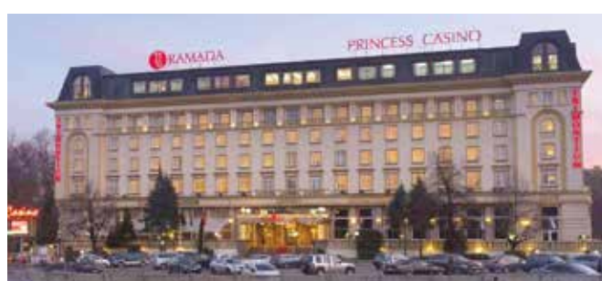
Ramada Trimontium Hotel

Located in the heart of the city, this elegant hotel provides a unique mix of furnishings including stone, antique furniture and contemporary art. Facilities include the restaurant with a beautifully painted dome, the terrace offering wonderful panoramic views towards Stara Planina and Sredna Gora and a bar. The rooms are spacious and feature all mod cons including air-conditioning, coffee machine, television and Wi-Fi.