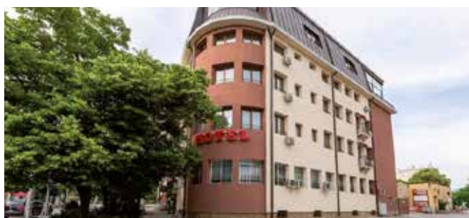
Hotel Konstantina Palace

Hotel Yantra is located in the heart of old Tarnovo and offers beautiful views over the city from its panoramic restaurant. The hotel features a spa, indoor pool, gym, patisserie and bar. The building itself is listed a cultural monument but the rooms come with all modern amenities including television, Wi-Fi and mini-bar.