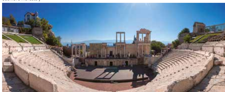
Roman theatre, Plovdiv