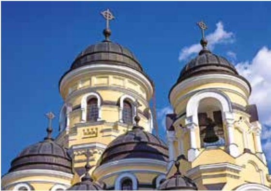
Domes of Capriana Monastery