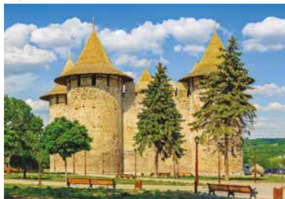
Medieval fortress at Soroca