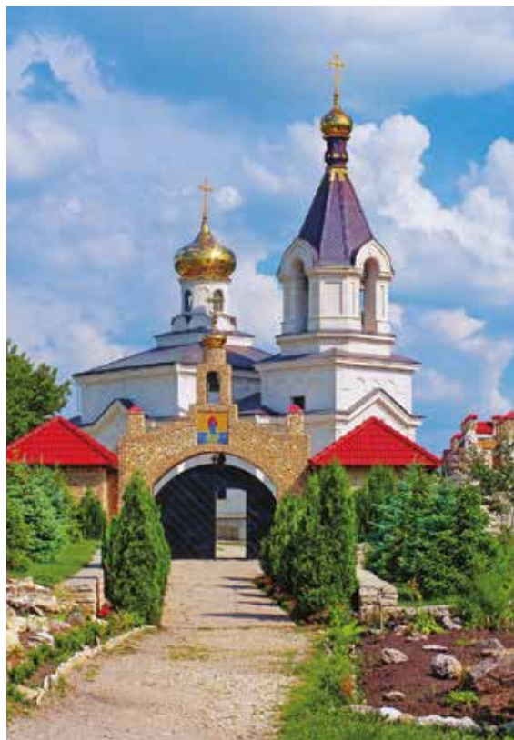
Orheiul Vechi Monastery

of the 'stone belt of fortresses' built to protect Moldova. Return to Chisinau for dinner this evening. (B,L,D)