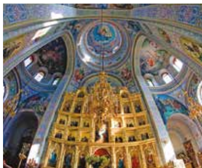
Interior of Capriana Monastery, Chisinau