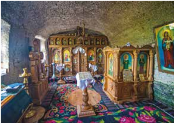
Interior of the Cave Monastery at Orheiul Vechi