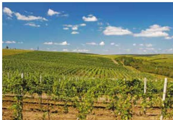
Vineyards of Cricova