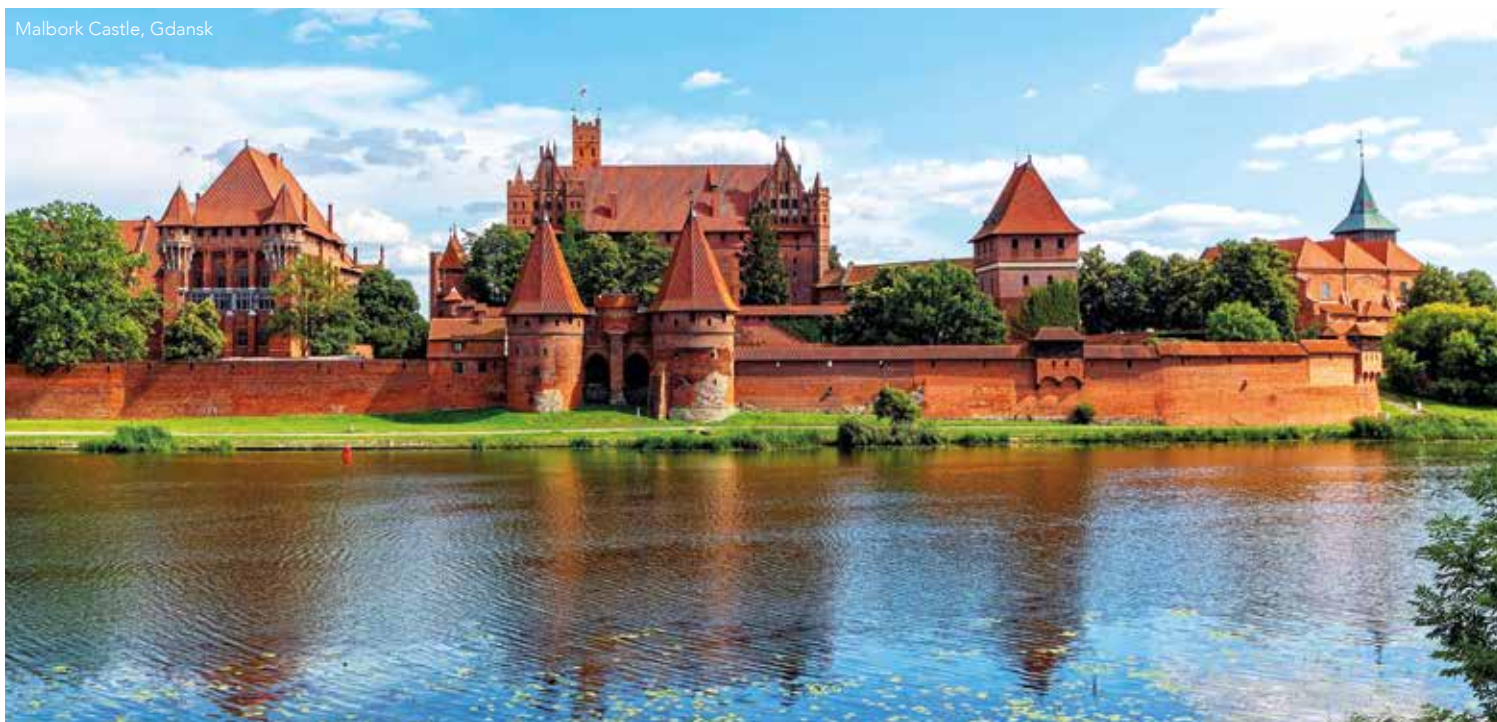
Malbork Castle, Gdansk

Exploring the Baltic by small ship is the most perfect way to visit this endlessly fascinating region which has for centuries been a crossroads of commerce, culture and maritime endeavour, linking the kingdoms, city states and empires of Northern Europe. Our summer voyage aboard the all-suite MS Hebridean Sky offers an opportunity to explore the rich heritage of the region, from beautifully preserved Medieval towns and grand royal capitals to remote islands, picturesque fishing villages and historic waterways.