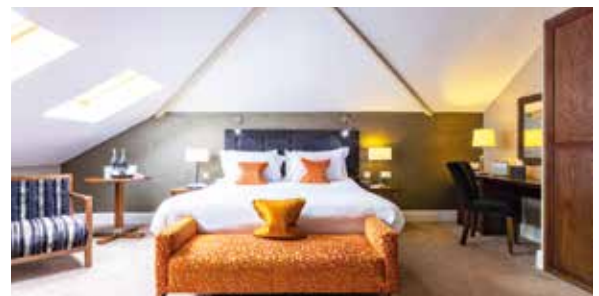
Luxury Twin/Double Room

Luxury Twin/Double Room: These rooms are situated on either the ground floor or second floor of the hotel and provide a relaxing and decadent stay. They feature super king Hypnos beds that can be configured as twin or double, an en-suite bathroom with either a shower over bath or separate bath and shower, extra comfortable sofas and spectacular views over the gardens or river.