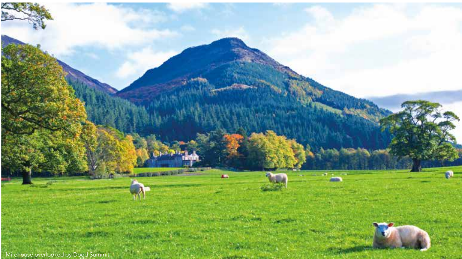
Mirehouse overlooked by Dodd Summit