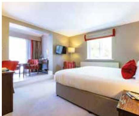
Classic Superior Double Room