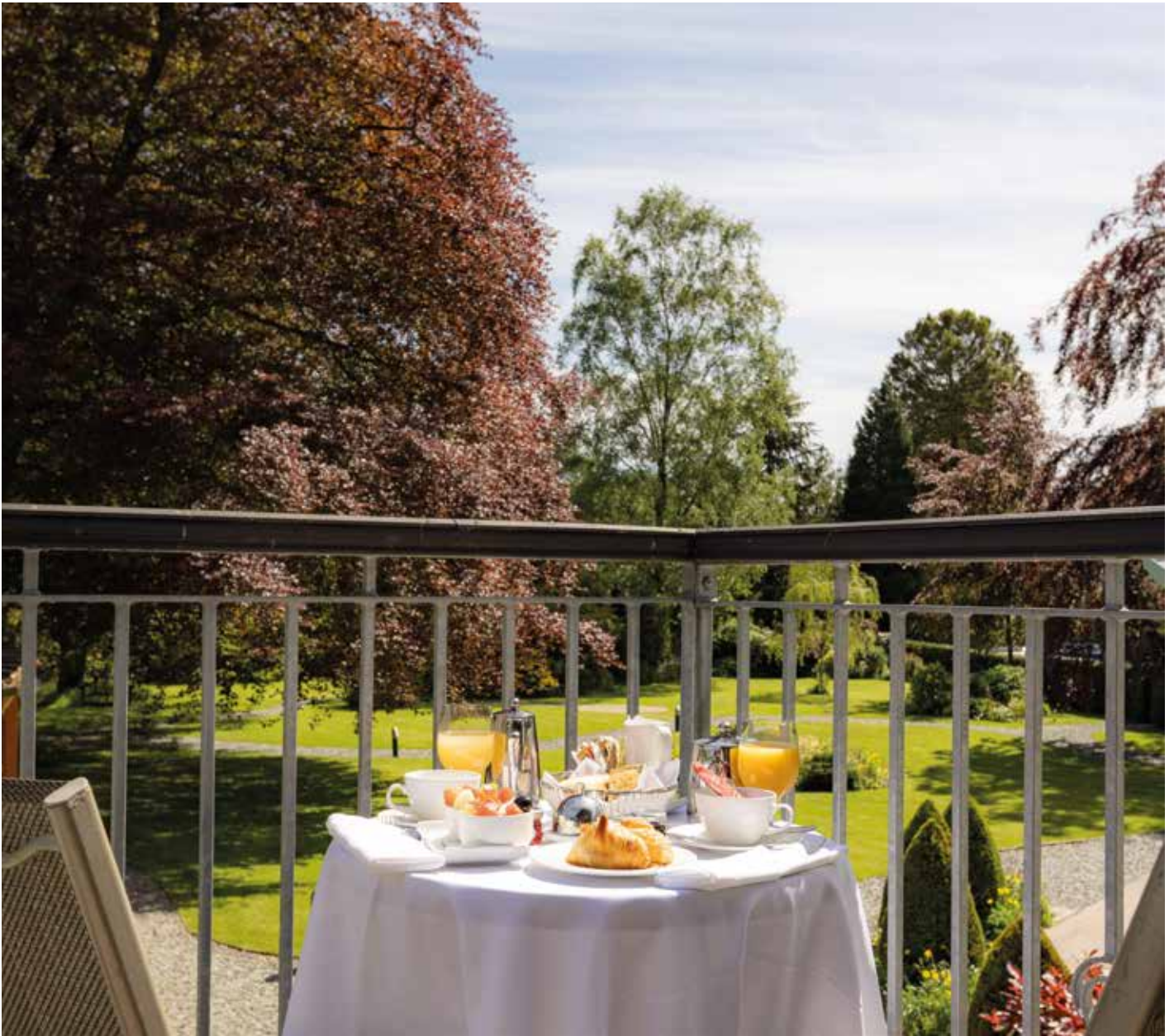
Deluxe Room with breakfast on the balcony