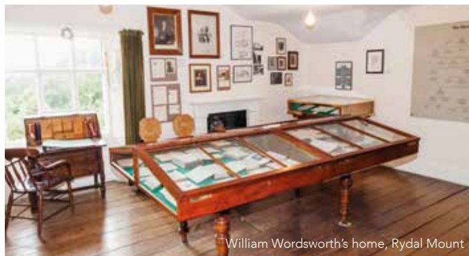
William Wordsworth's home, Rydal Mount