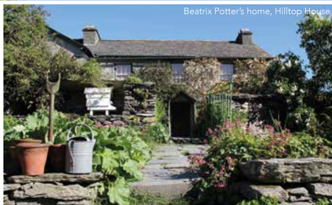
Beatrix Potter's home, Hilltop House