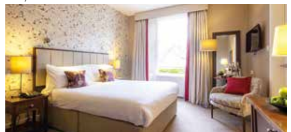
Classic Double Room