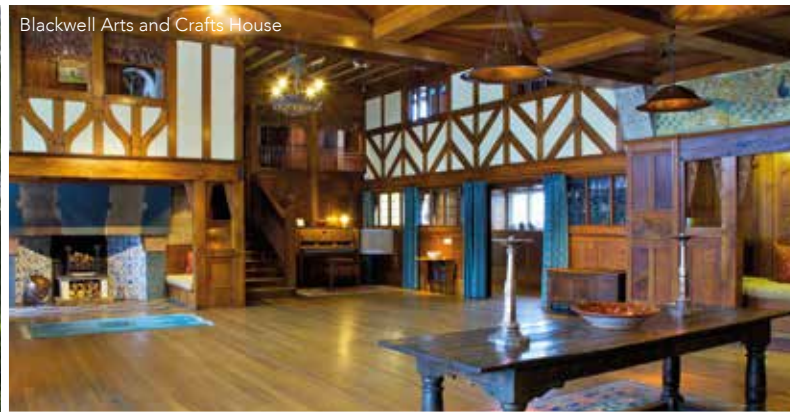
Blackwell Arts and Crafts House