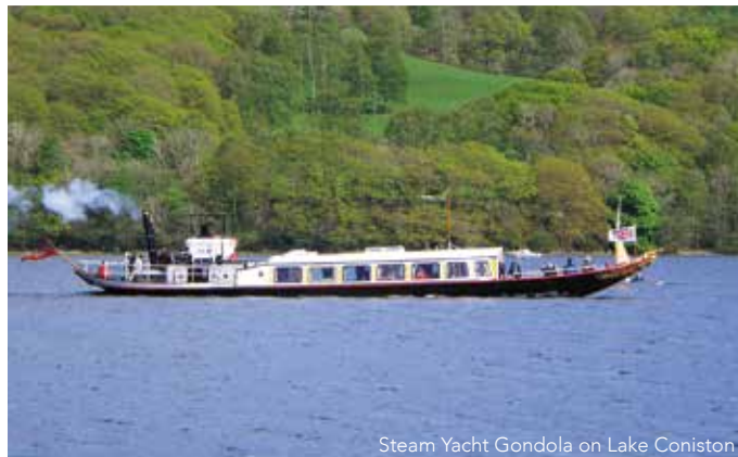
Steam Yacht Gondola on Lake Coniston

depart for Bowness on Windermere to explore Blackwell – the amazing Arts and Crafts house. Designed by architect Mackay Hugh Baillie Scott in 1901, it has beautiful interiors with decorative features including furniture, tiles and plasterwork. Step out to the terrace garden designed by Thomas Mawson and take in the dramatic scenery towards Consiton Fells, Grizedale Forest and Lake Windermere. Enjoy dinner in the hotel followed by a talk, 'The Dryads Crown – A Celebration of Nature, Arts and Literature'. (B, L, D)