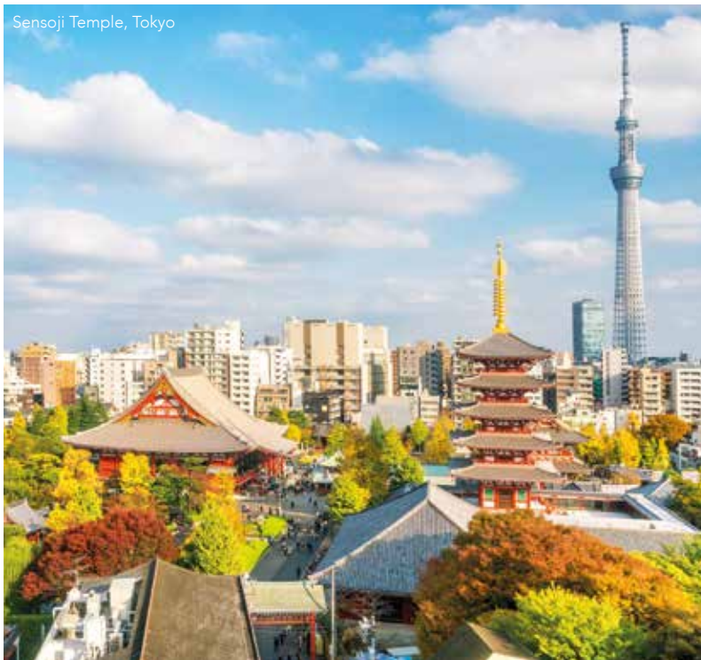
Sensoji Temple, Tokyo