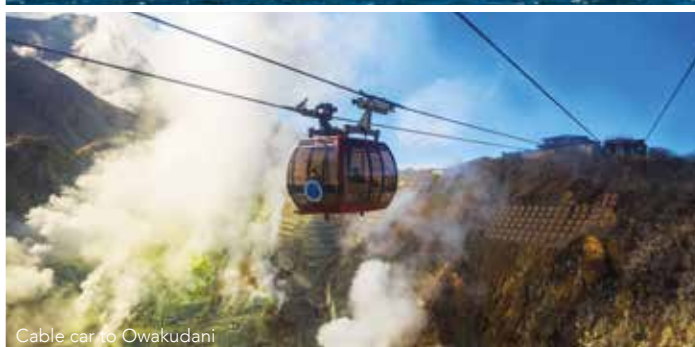
Cable car to Owakudani