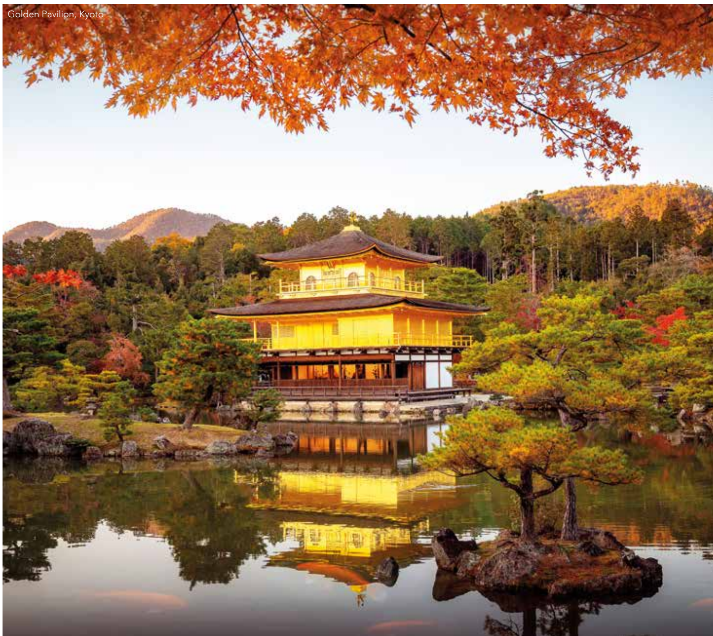
Golden Pavilion, Kyoto

Japan is a fascinating country with a unique heritage, ancient traditions and culture juxtaposed with the ultra-modern sprawling metropolises of the world's most advanced technological civilisation. Our new escorted overland tour has been designed to give an in-depth view of the country, combining both modern and traditional Japan with the added benefit of being timed for November, a magical time of year when the landscapes burst into colour with the arrival of the autumn foliage, when the leaves of the maple trees and ginkgo trees turn red and yellow presenting beautiful scenery at every turn.