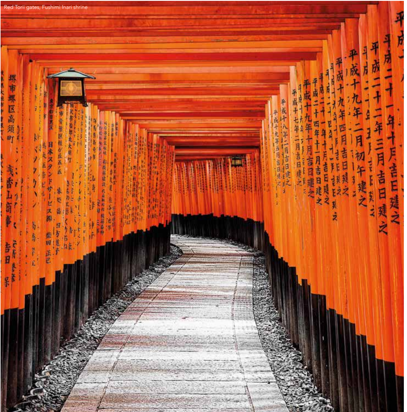
Red Torii gates, Fushimi Inari shrine