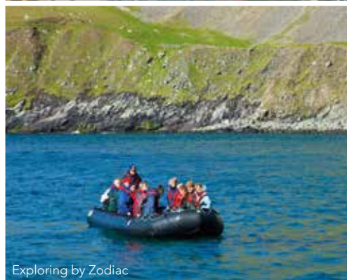
Exploring by Zodiac