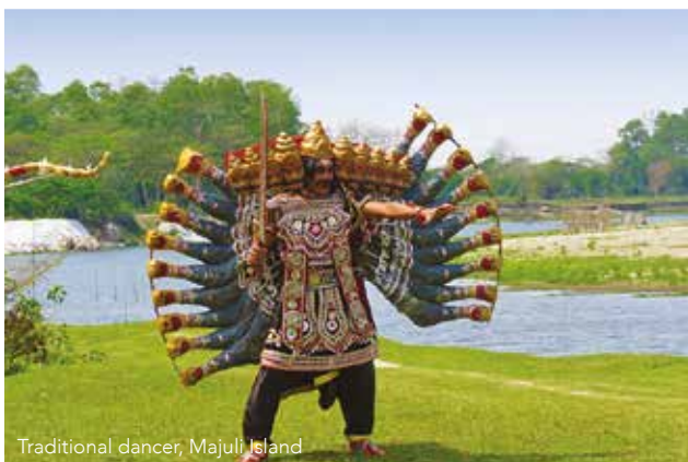
Traditional dancer, Majuli Island