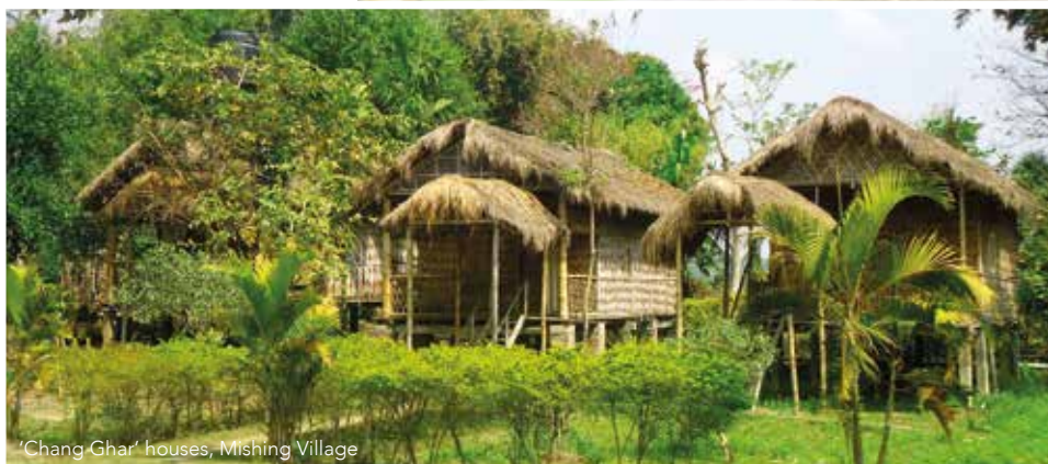
'Chang Ghar' houses, Mishing Village