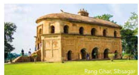
Rang Ghar, Sibsagar

"For our exploration of the Brahmaputra River we have chartered the MV Mahabaahu, whose operators have a long-established presence in Assam and a wealth of local expertise. We have designed the itinerary around a seven night cruise in order to offer the intrepid traveller a true taste of this remarkable region without having to leave home shores for a prolonged period of time. The MV Mahabaahu offers considerable comfort across all five of her decks and her size, facilities and refinement set her apart from many of the cruise ships in this region. When not ashore sightseeing or spotting some of India's finest wildlife you can take a dip in the pool, enjoy a massage treatment or simply enjoy lazing on the top deck whilst watching life unfold on the riverbank."