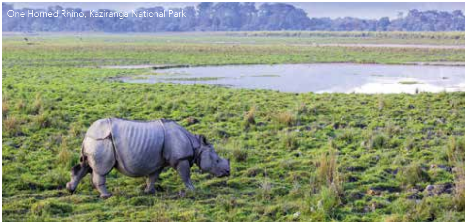
One Horned Rhino, Kaziranga National Park