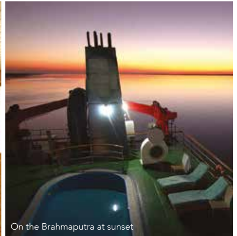
On the Brahmaputra at sunset