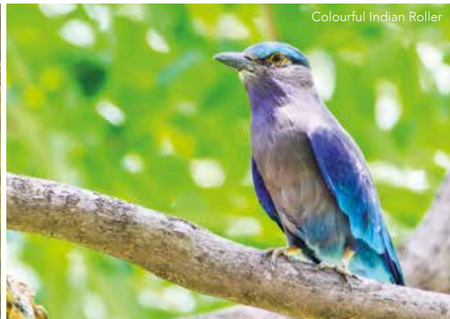
Colourful Indian Roller