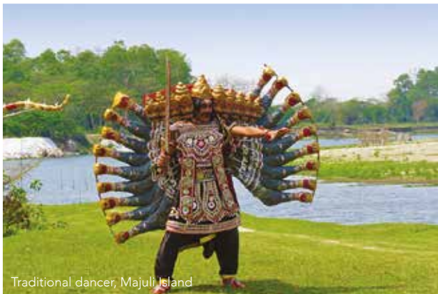
Traditional dancer, Majuli Island