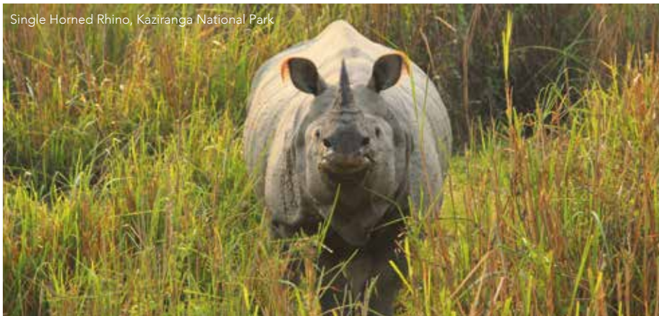
Single Horned Rhino, Kaziranga National Park