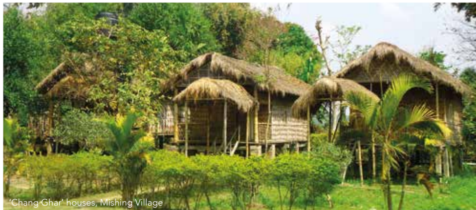
'Chang Ghar' houses, Mishing Village