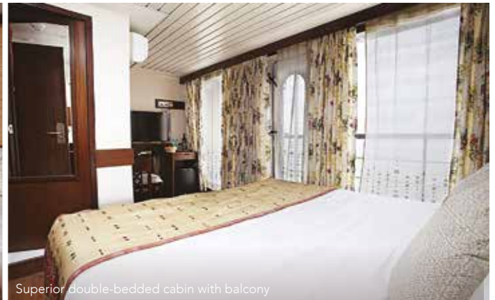
Superior double-bedded cabin with balcony

For our exploration of Assam and the great Brahmaputra River we have chartered the MV Mahabaahu, a stylish and elegant vessel which accommodates 46 guests. The vessel has a total of five decks and facilities include a swimming pool, spa and restaurant and an open top deck from where you can watch the busy life of the waterside villages pass by as well as watch for wildlife.