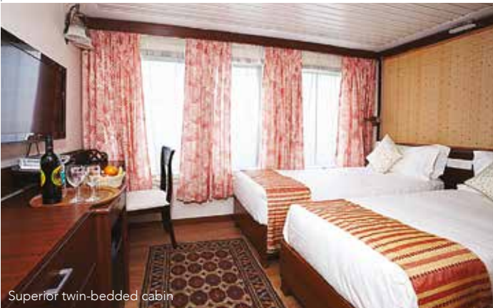
Superior twin-bedded cabin