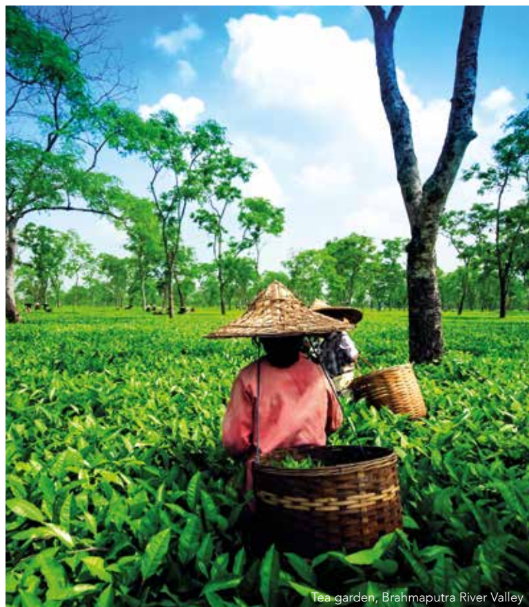
Tea garden, Brahmaputra River Valley

On today's excursion, we will witness a traditional cultural performance before travelling to Kamalabari monastery to witness Vaishnavite priests carrying out their ritualistic ceremonies. After lunch on board our vessel, we head by jeep to Sibsagar, the one-time capital of the kings of Assam. Shan by origin (Assam and Siam share the same derivation) but converted to Hinduism, they ruled Assam for some 700 years until the 1820s, and their culture and architecture is a strange and delightful amalgam of Indian and South East Asian. We will see temples with stupa-like profiles, and palaces of distinctive form. For the record book, the temple tank here is believed to be the world's largest hand-excavated reservoir. We return to our vessel for a farewell dinner.