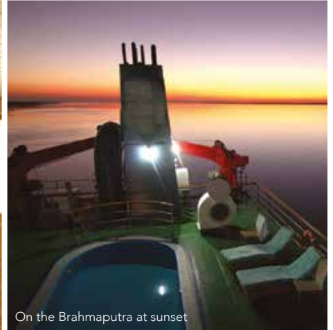
On the Brahmaputra at sunset