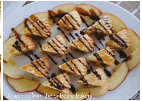
Delicacies from the onboard bakery