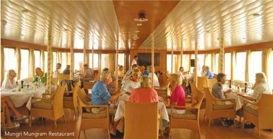
Mungri Mungram Restaurant